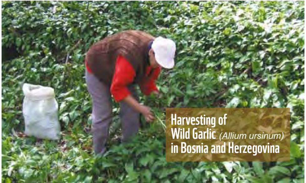
Harvesting of Wild Garlic ( Allium ursinum ) in Bosnia and Herzegovina