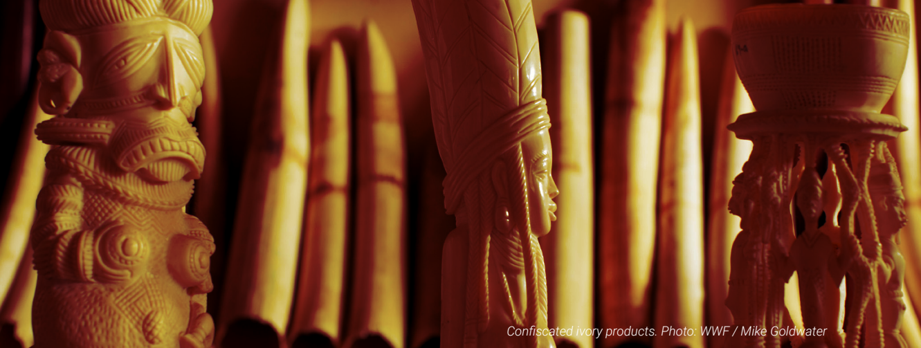
Confiscated ivory products.