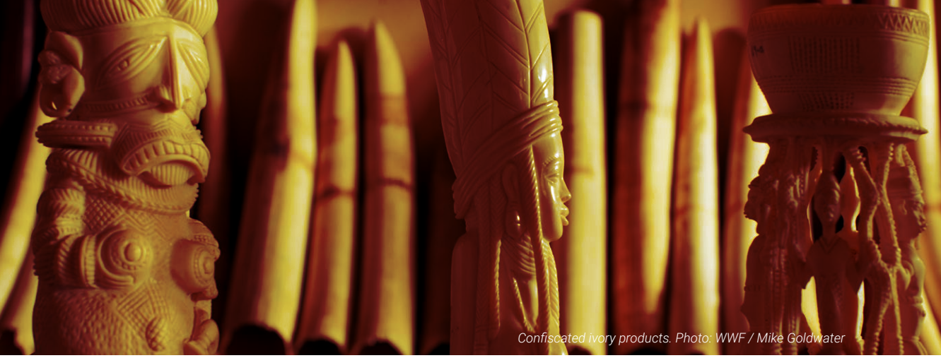
Confiscated ivory products.