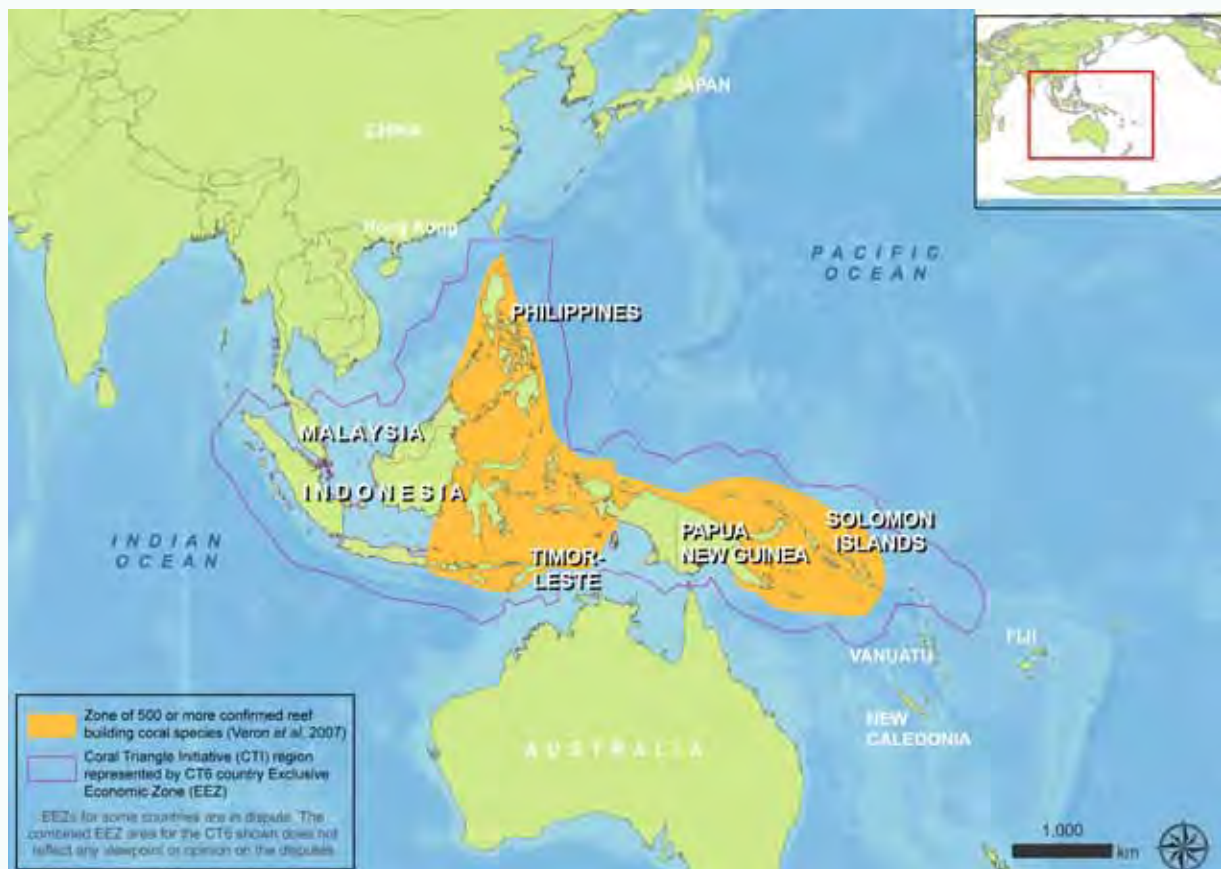
Map of the Coral Triangle region © Coral Geographic (Veron et al. , unpublished data)

Action on sharks by the Food and Agriculture Organization of the United Nations (FAO), international treaties such as the Convention on International Trade in Endangered Species of Wild Fauna and Flora (CITES), regional fisheries management organizations (RFMOs) and shark catching countries and entities, has been prompted by increasing international concern for shark stocks due to a growing body of evidence that many shark species are threatened and continuing to decline due to unregulated fishing.