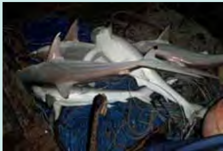
Shark products located on board an Indonesian fishing vessel apprehended in 2012 in Australia's northern waters

Illegal, unreported and unregulated (IUU) fishing by Indonesian vessels in northern Australian waters has been common over the last decade with shark taken illegally routinely finned (Lack and Sant, 2008). However, there has been a marked reduction in IUU fishing in northern Australian waters in recent years, including IUU fishing by Indonesian vessels. In the 2006 calendar year, a total of 365 foreign vessels were apprehended in Australia's northern waters. However, between July 2008 and June 2012 only 76 Indonesian and PNG vessels were apprehended. Of these, 60 Indonesian vessels were targeting shark. Most incursions into the Australian Fishing Zone (AFZ) now occur at the outer extremities of the maritime boundary with periodic opportunistic shallow forays into Australian waters. (G. Lovelock, Australian Fisheries Management Authority in litt. to G. Sant, TRAFFIC, 31 August 2012).