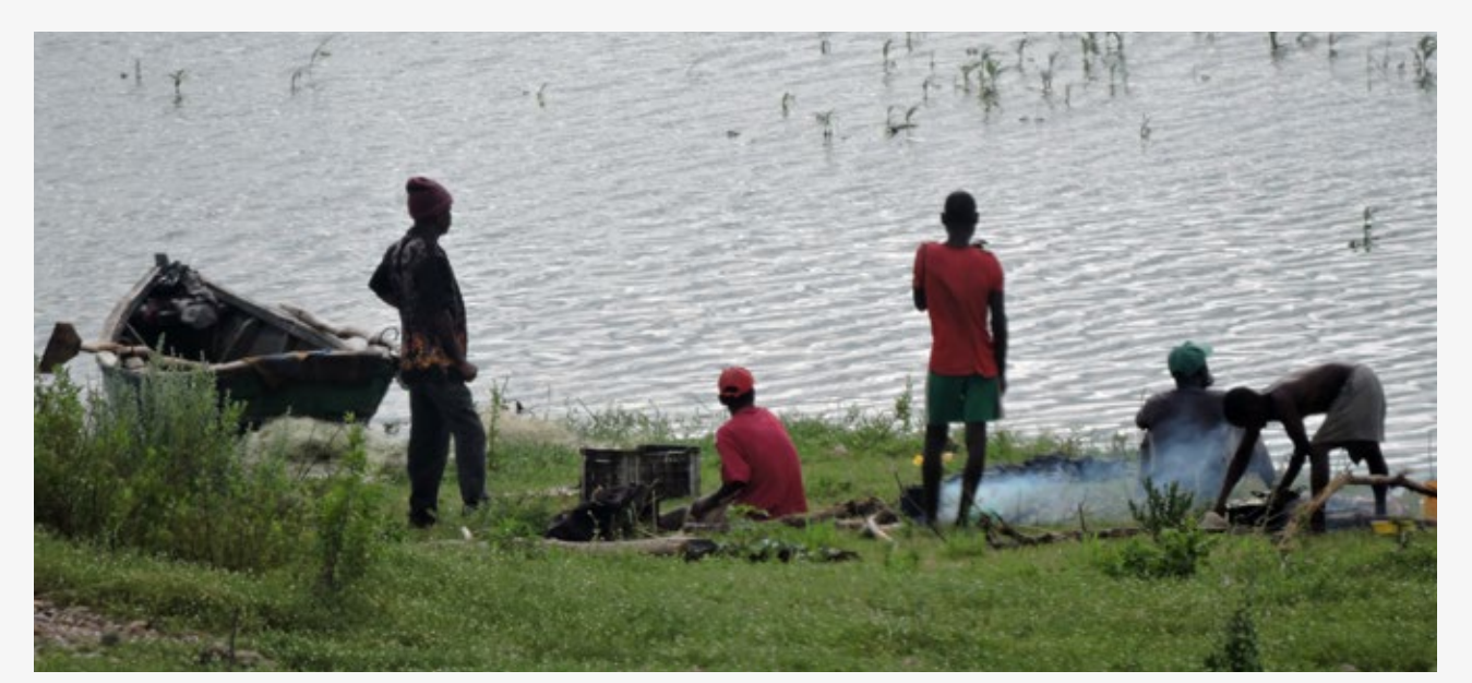
Fishers of a community in Massingir, Mozambique return from their day of fishing to cook a meal on the banks of Massingir Dam (Massingir is a district on the eastern border of Kruger National Park, South Africa).

While the majority of offenders exhibited the above characteristics (incomplete education, insecure employment status and families financially dependent on them), there were some offenders for whom this was not true. These offenders were more educated (17%), having completed secondary schooling or higher, some were also formally employed (25%), and they did not consider themselves to be "poor" or "struggling financially" (26%). There were only six offenders who encompassed all three of these attributes (more educated, formally employed and did not consider themselves "poor"). These six offenders were mostly involved in activities such as the recruitment of poachers and transporters, or the sale of the commodity to domestic or international buyers or intermediaries.