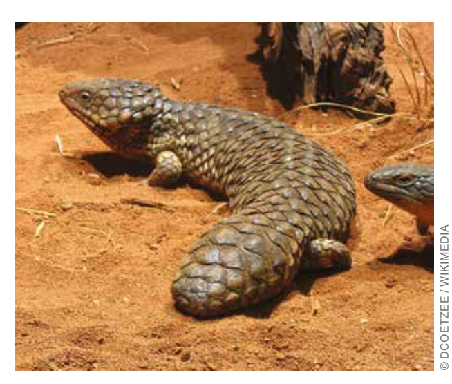
Australian endemic species: Shingleback Lizard Tiliqua rugosa.

Those countries that are the main consumers of trafficked specimens should therefore take responsibility and support national conservation measures of the countries of origin. Important consumer markets, such as the EU, with its central role as a destination and hub for trade in such species, should develop legal measures to combat this form of wildlife crime. Passing legislation comparable to the US Lacey Act, making import, sale and purchase of specimens illegally acquired in range States a criminal act in their countries, would be a proven and meaningful option. Examples of how the US Lacey Act is enforced are given e.g. by Global Trade Expertise (2018). Furthermore, in order to prevent the unsustainable offtake from populations in the wild, it is imperative that EU countries assist range States in order to prevent illegal harvest and trade in these species.