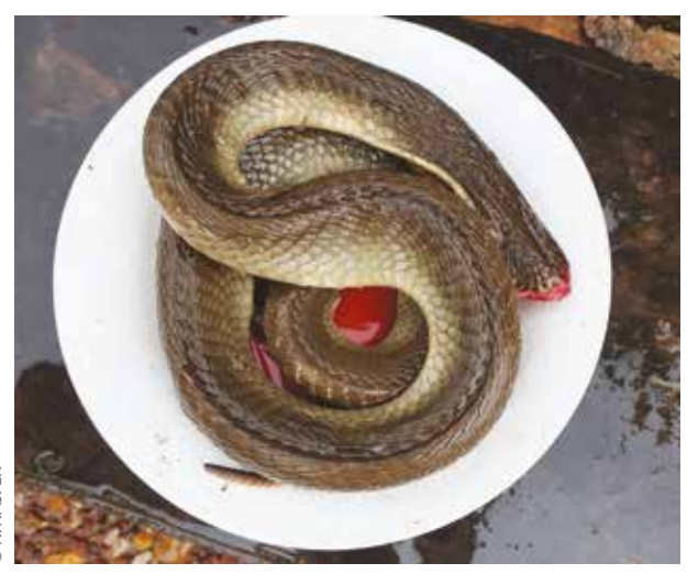
Body of a cobra Naja sp., Khammouane Province.

Further details of the surveys under discussion, including a socio-economic assessment of this study involving considerations of consumer behaviour and livelihood needs driving personal engagement in poaching are currently being analysed and will be published in due course.