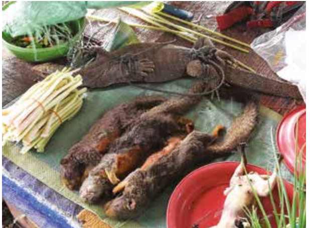
Market stall in Khammouane Province, with live Clouded Monitor Varanus nebulosus and freshly killed squirrels and a rat.

The Lao Wildlife and Aquatic Law (LWAL) (No.7, 2007) applies to wildlife species that are divided into three categories: those considered to be at risk of extinction and of high value, which are listed in the Prohibition Category 1 [P] and their use prohibited without permission; Management Category 2 species [M] are managed and include those of national economic, social and environmental interest and important to livelihoods, and their use is controlled. Species listed in Categories 1 and 2 are included in Decree No. 81/ PM (2008). Category 3 [C] species (listed in Decree No. 70/PM (2008)) include those that can reproduce