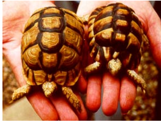
The Egyptian Tortoise T. kleinmanni is rare and considered Endangered by IUCN.

Notably, Malta and Poland imported relatively high numbers (494 specimens) of Testudo kleinmanni in recent years. The EU, in comparison, imported only 14 specimens in the same time period. This species is listed in Annex A and CITES Appendix I and hence commercial trade in wild specimens of this species should not be allowed. The species is considered Endangered by IUCN (IUCN, 2003) and it is found only in Libya and Egypt, with a very small population still surviving in Egypt. The majority of the 494 specimens (470 specimens) were imported by Malta, all imported from Libya, which joined CITES only recently (January 2003). No information regarding the source and purpose of this trade has been provided.