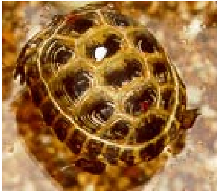
Horsfield's Tortoises Testudo horsfieldii have a wide distribution in central Asia.

among European hobbyists and adults can fetch prices of around € 200 in the EU. Live specimens of these tortoises originating from the wild have been banned from import into the EU since 1999, owing to the high mortality rates of this species in captivity. It is assumed that a significant portion of tortoises smuggled into Poland are destined to be traded to neighbouring EU countries. Hungary seems to be another important transit country for tortoises, most of which are being imported from the Balkan countries and other eastern Mediterranean countries. It is likely that most of these are intended for (illegal) re-export to western Europe. Between 2000 and 2002, Hungarian authorities confiscated 837 live specimens of Testudo hermanni that had been illegally imported from Serbia and Montenegro, Macedonia and Romania.