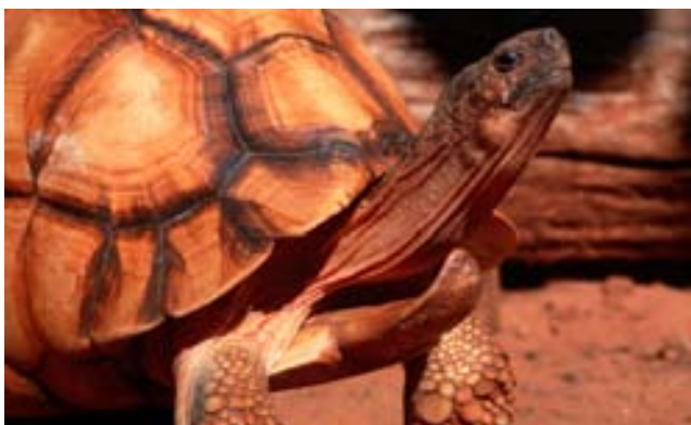
The Madagascar Tortoise or Angonoka Geochelone yniphora is one of the rarest tortoises in the world and is considered Endangered by IUCN.

According to information received from anonymous sources, several rare species of tortoises are also being kept in the Czech Republic and have been offered for sale to traders in the EU; these include, for example, two specimens of the Madagacar Tortoise Geochelone yniphora , 80 Radiated Tortoises Geochelone radiata , more than 60 Burmese Tortoises Geochelone platynota , 30 Kleinmann's Tortoises Testudo kleinmanni and 28 Flat-backed Spider Tortoises Pyxis planicauda , offered in 2003 by two traders alone. The legal status of these animals is unclear.