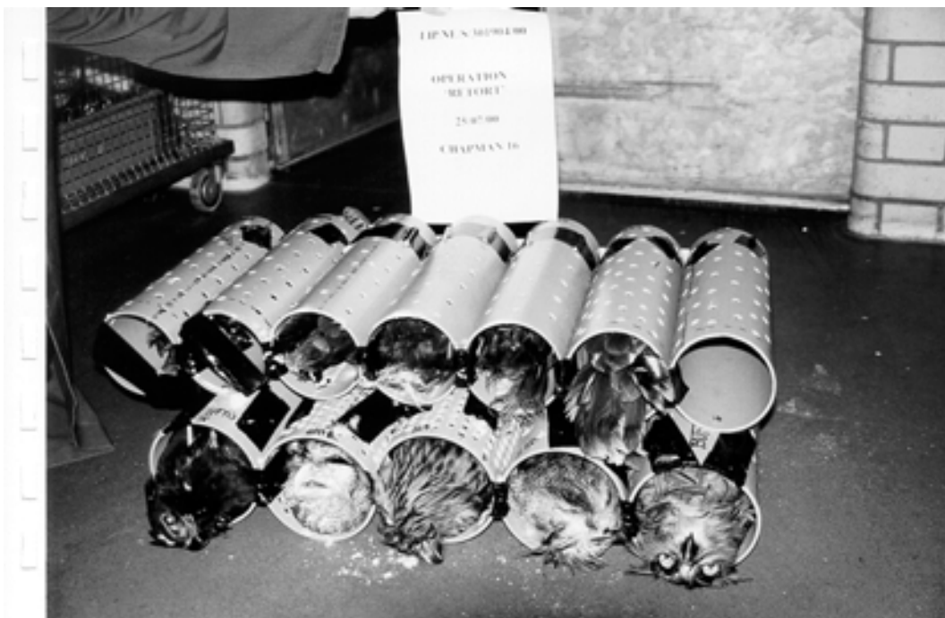
Often smugglers try to conceal live animals in their baggage. These birds of prey were found in July 2000 at Heathrow Airport, UK, in the luggage of a passenger travelling from Thailand.

Several of the requirements of the EU regulations are stricter than existing comparable regulations in the Acceding States, for example, those requiring the marking of Annex-A specimens or certificates for internal EU trade (Article 10 certificates). Consequently, there is a risk that some methods of illegal trade, such as mis-declaration and permit fraud, are likely to occur more often in the EU after accession.