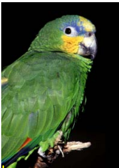
The Orange-winged Amazon Amazona amazonica . Between 1996 and 2002 the EU Member States and the ten Acceding States imported more than 65 000 live specimens.

The EU is one of the largest and most diverse markets for live animal and plant species and their products. The enlargement of the EU from 15 to 25 countries will with no doubt increase the size and importance of the EU's single market globally. Since the fall of the Iron Curtain in the early 1990s, international trade involving the Acceding States has increased and several of the countries have become significant transit points for animal and plant species destined to EU markets from around the world. The majority of that trade is driven by the demand of western European countries, but Acceding States also import wildlife from EU Member States and are important consumers of wildlife themselves.