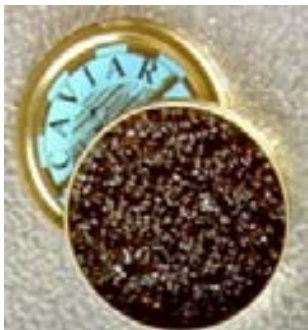
The EU is the largest importer of caviar

The EU Member States constitute the largest importer of caviar , importing a total of 572 t between 1998 and 2002 (Table 1). France and Germany, the largest importers, imported 210 and 197 t, respectively. The Acceding States reported total imports of around seven tonnes of caviar for the same period. However, for the same period, these States reported combined (re-) exports of four times that volume, of which the majority came from Poland. Whether the difference of 21 t originates from stocks that were acquired before the CITES listing (called 'pre-Convention'), as claimed by Poland for instance, is doubtful and remains difficult to verify in retrospect.