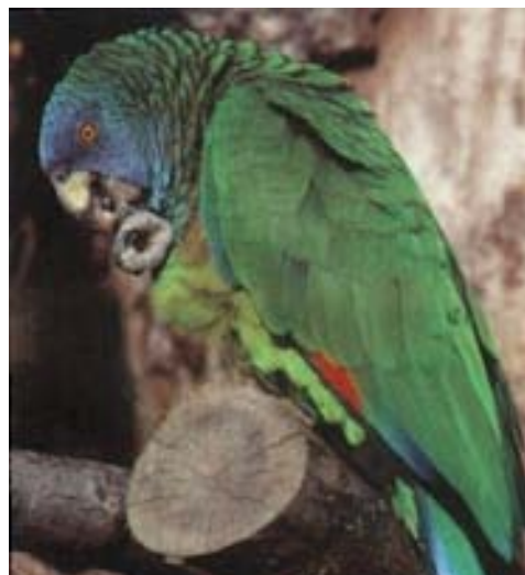
Several specimens of the Saint Lucia Amazon Amazona versicolor (EU Annex A/CITES Appendix I) are allegedly illegally kept in the Czech Republic. Of this species only 300-350 birds remain in the wild.

In recent years, the Acceding States have seized an increasing number of live parrots and reptiles, including some rare and strictly protected species. For example, between 2000 and 2002, 248 parrots were seized in the Czech Republic and 172 in Slovakia . Among them were several EU Annex-A/CITES Appendix-I listed species such as the Moluccan Cockatoo Cacatua moluccensis and the Cuban Amazon Amazona leucocephala , which is not commonly found in trade and which can fetch very high prices among hobbyists. According to Czech authorities there are several specimens of the rare Saint Lucia Amazon Amazona versicolor (EU Annex A/CITES Appendix I) being illegally kept in the Czech Republic (Anon., 2002). These birds are only found on the Caribbean island of Saint Lucia and the total population in the wild is estimated at not more than 300 to 350 birds (Juniper and Parr, 1998). The species is strictly protected in Saint Lucia (Anon., 2004b) and, according to CITES trade data, only 14 live specimens have been reported in international trade between 1975 and 2002; no imports to the Czech Republic have been reported.