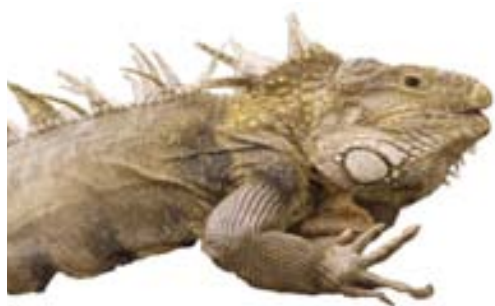
The Iguana Iguana iguana is the reptile species imported in the highest numbers by the EU.

Among the live birds imported were almost 1.6 million live parrots (see Table B in Annex II). Portugal and Spain are the largest importers of live birds within the EU, whereas Malta and the Czech Republic are the main importers of CITES-listed birds among the Acceding States (see Annex II). Interestingly, there are strong trade links between the existing and Acceding EU Member States: almost one-third of the parrots imported by the Acceding States come from the EU, whereas the great majority (92%) of the parrots exported by the Acceding States (more than 75 000 specimens) went to the EU (mainly Spain, Italy, France, Greece and Portugal). After Accession, all of this trade will be considered internal EU trade and no import or export documents will be required.