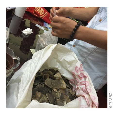
Raw pangolin scales for sale in TCM wholesale market

When asked about the source of the scales, most traders refused to answer or answered evasively, clearly illustrating their knowledge of the laws and the illegality of the trade. Only 34% of animal medicine wholesalers with scales for sale were willing to reveal their source—pangolin scales sourced from overseas were mainly claimed to be from Southeast Asian countries, including Myanmar and Viet Nam, as well as African countries. Scales from domestic sources were mainly from Guangxi and Yunnan provinces (which border Viet Nam and Myanmar respectively). However, according to traders in Guangxi, Viet Nam was merely a transit country for pangolin scales, and a lot of scales were in fact sourced from Pakistan. 18% of TCM retail shops with scales for sale revealed that scales were bought from pharmaceutical companies, except for one shop that sourced them from Viet Nam. Since pangolin scales are only allowed to be sold in designated TCM hospitals and to be manufactured into patented medicine by