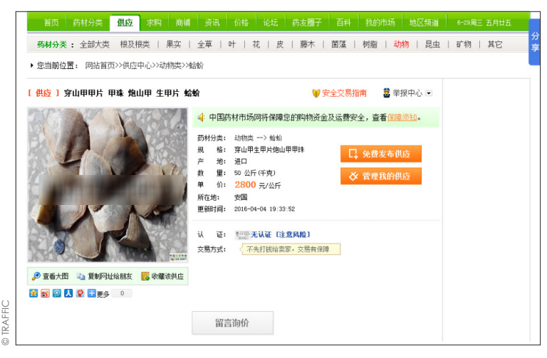
Raw pangolin scales for sale on a TCM website

Nam (26%), African countries (16%: two advertisements named the sources as Nigeria and Equatorial Guinea), Thailand (10%) as well as Myanmar and Indonesia. Within China, scales were mainly sourced from Guangxi and Yunnan provinces (55% in total), followed by Shaanxi, Guangdong, Guizhou and Hebei provinces. The average price on Website B was USD427±150/kg (n=56), which is lower than prices at physical TCM wholesale markets (by USD74-107/kg), and less than half that of prices in TCM retail shops. When entering "pangolin" into the search box on the website, researchers found various advertisements for pangolin