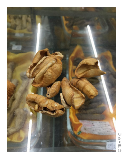
Processed pangolin scales for sale in retail TCM shop

The survey found that the major types of pangolin products on sale were raw scales, processed scales, scale powder and scale/nail carvings. In total, 74 animal medicine wholesalers and 67 TCM retail shops were found to offer pangolin scales for sale, and 13 shops for collectibles were found to sell pangolin scale/nail carvings. Compared with a survey conducted by TRAFFIC ten years ago (Xu, 2009), the percentage of TCM retail shops selling pangolin scales decreased from 82% in 2006/2007 to 62% in 2016. Meanwhile, the percentage of stalls in TCM wholesale markets selling scales increased from 12.5% in 2006/2007 to 35% in 2016, indicating that the illegal trade of pangolin scales is still on-going in China's TCM markets. However, a positive change has been seen in terms of the consumption of pangolin meat. Only two (2%) restaurants surveyed clearly stated that pangolin meat was offered while 9 (18%) restaurants had pangolin meat for sale in 2006/2007, and "pangolin" or "ground dragon" was never even identified in restaurants outside of Guangdong, Guangxi and Yunnan