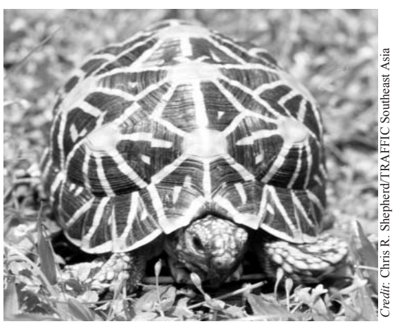
The carapace patterns makes the Indian Star Tortoise highly prized in the pet trade

Nesting seasons coincide with the monsoons. In western India, the nesting season is mid-November, while in south-eastern India eggs are laid from March to June, as well as from October to January. Clutch size is 1-10 eggs with an incubation period of 47-178 days (Das, 2002).