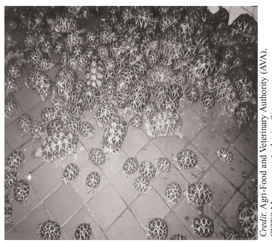
Confiscated Indian Star Tortoises, Singapore

When questioned about penalties, retailers contended that if only one or two tortoises were found inpersonal luggage, the worst-case scenario would be confiscation of the animals by the Customs authorities, but transporters would not be fined, prosecuted or jailed. One retailer even offered his personal details for Malaysian Customs officials to contact should there be a problem with the export. The nexus between the smugglers and import/export officials is considered a primary factor that permits the trade to flourish (Sekhar et al. , 2004).