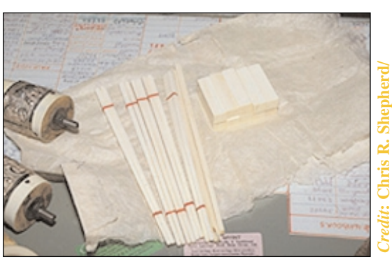
Ivory chopsticks and name seals, seen in Myanmar, 2000

from domestic elephants). In May 1999 the author surveyed all 43 of these jewellery and souvenir shops in Mae Sai. Of these, 26 were observed to have carved ivory for sale. A few of these shops had some imitation ivory for sale as well. Items observed included chopsticks, bracelets, cigarette holders, pendants and seal blocks. Dealers stated that the ivory was all from Myanmar – either Yangon or Mandalay. When questioned, these dealers stated that the ivory most likely originated from elephants in Myanmar or India (Shepherd, 1999b).