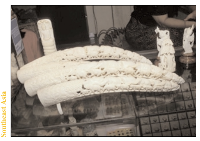
Ivory carvings on display in Yangon, Myanmar, 2000

supply the immediate market. Not only is the number of traditional works being produced decreasing, but so is the number of traditional carvers. The art of carving ivory, passed down for generations, is vanishing or being replaced by modern "quantity, not quality" attitudes. This may also be a result of the modern market. Traditionally much ivory was sold to people in Myanmar, as status symbols, and decorative items. Now very little of the ivory carved in Myanmar is sold to locals. The vast majority is sold as souvenirs and stamp blocks to people with, according to one carver, a much lower degree of appreciation for the real traditional works of art.