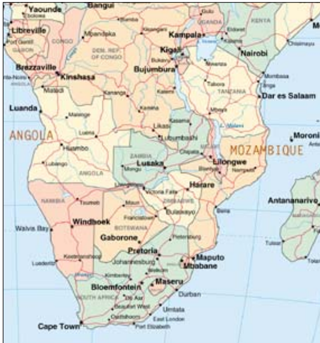
Map showing the position of Angola and Mozambique in southern Africa

Ivory trade in southern Africa is, generally speaking, better regulated than in any other part of the continent. That said, two countries in this region stand out as serious anomalies and continue to harbour significant unregulated domestic ivory markets. Interestingly, both countries—Angola and Mozambique—share a common history as former Portuguese colonies that were crippled at the onset of independence by long, debilitating civil wars. Now, in Mozambique, more than a decade of peace has seen dramatic progress towards nation-building and economic growth, but in Angola, just three short years have passed since conflict ended. With far greater national priorities at hand, attention to the wildlife sector lags far behind other more pressing development aspirations in both of these resource-rich countries where some 70% of the people are estimated to live below the poverty line (Anon., 2005a; Anon., 2005b). Perhaps for this reason, illicit trade in