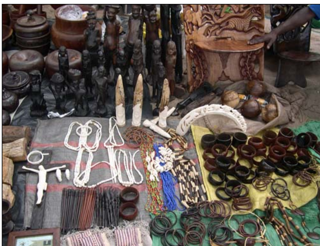
Ivory for sale among other crafts at a stall in Beira, the second-largest city in Mozambique, in February 2006.

the survey and it is very likely that more would have come later. It was noted that this market, near a major hotel right on the beach, featured lots of seashells for sale, including some protected species. A total of 19 ivory products were seen, including two finger rings and eight bangles. Composite ivory and wood pieces included one small ebony/ivory box, six Makonde-style 4 Maasai busts and two life-size Maasai figures carved out of ebony Diospyros spp. but featuring ivory and tortoiseshell inlay work.