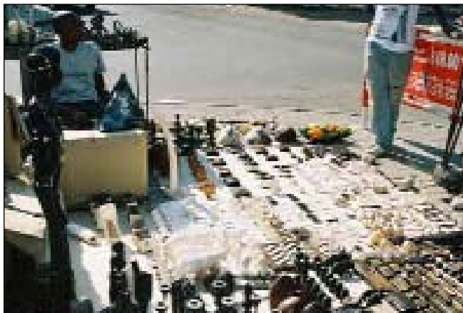
Pavement display of crafts for sale, including several ivory items, in Maputo, Mozambique, in 2005.