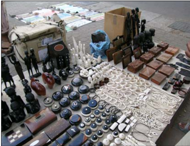
Ivory on sale at a street-side stall in Maputo, Mozambique, in April 2004.