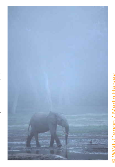
African Forest Elephant Loxodonta africana cyclotis

same items were practically the same price: four big busts of about 1.5 kg at CFA695,000 (USD1,139), two smaller ones at CFA295,000 (USD484), and a rendition of the Last Supper at CFA495,000 (USD811). When the principal researcher declared the real purpose of her visit to the owner of the shop, a French expatriate, he suddenly showed an extreme uneasiness. He claimed that all the ivory displayed was old stock and he was not selling any ivory anyway. This was probably true for the majority of the big items. However, when questioned about a pile of blank name seals, the vendors assistant had previously replied that they were usually bought by Asiatic clients. Judging from the style of carving, some pieces had no doubt been imported from Côte d'Ivoire. The owner, however, said the ivory came from Sudan, but did not seem to be too sure about this. He was apparently fully aware of the international ivory ban. He tentatively said he had heard it was now allowed to hunt savanna elephant for their ivory, while forest elephant hunting remained forbidden.