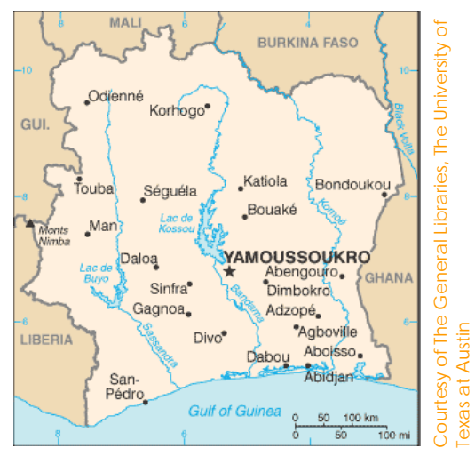
Map of Côte d'Ivoire

The large-scale conversion of forest to cultivated land, a process that commenced at the turn of the 20<sup>th</sup> century and continues through to the present, has resulted in a profound fragmentation of Côte d'Ivoire's population of African Elephants. Now believed to occur in some 24 separate locations in the country, the status of the species is poorly known as there has been very little survey work in recent years (Barnes et al., 1999; Blanc et al., 2003). According to the most recent estimates using the IUCN African Elephant Database population data categories, Côte d'Ivoire has a very small elephant population, with only 63 in the 'Definite' category, another 360 considered 'Possible' and a further 666 in the 'Speculative' category (Blanc et al., 2003). Although most elephants occur in protected areas, many small