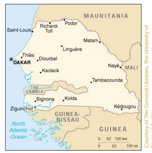
Map of Senegal

Although African Elephants were historically found over most of the country, Senegal now remains a range State by virtue of a single population whose future remains very