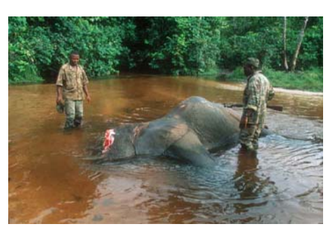
African Forest Elephant killed by poachers being inspected by game guards. Dzanga-Ndoki National Park, Central African Republic

As found to be the case in previous studies, most of the ivory found in Nigeria has been imported from Central African countries, with the Democratic Republic of the Congo, Central African Republic, Congo (Brazzaville), Gabon and Cameroon the most frequently mentioned sources. There may be some slight shifts in terms of the relative roles these countries play in the trade. For example, Congo (Brazzaville) was not identified as a source country at all, and Gabon was only rarely mentioned in the Martin and Stiles (2000) report. In the present study, Chad was also sometimes mentioned as a source of ivory, but it is important to remember that this country lies along one of the most important trade routes starting in the Central African Republic, passing through Cameroon, and entering Nigeria from Chad in the far