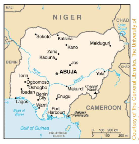
Map of Nigeria

The ivory trade in Nigeria, which traditionally encompassed a range of activities, including hunting, carving and selling, has a history that dates back to before the Colonial era. Well-established