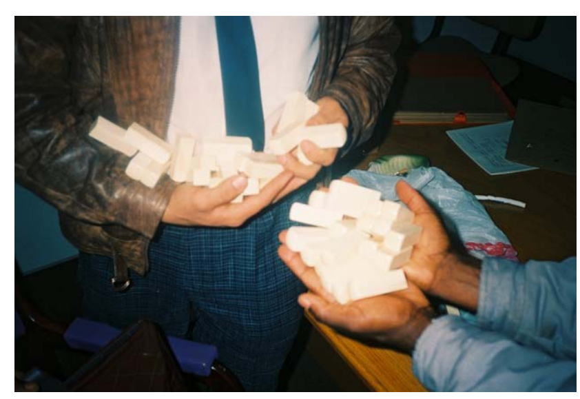
Confiscated ivory name seal blanks