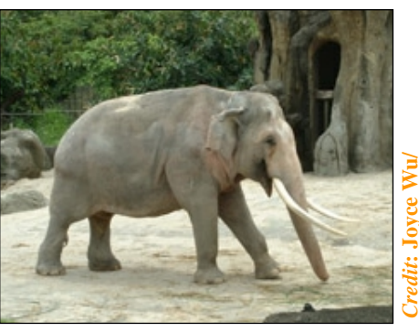
An old Asian Elephant Elephas maximus in Taipei Zoo

(ii) that recording and inspection procedures to enable the Management Authority and other appropriate government agencies to monitor the flow of ivory within the State be introduced.