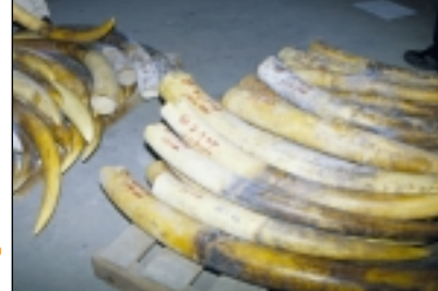
Ivory seized by Customs authorities in Taiwan

The Taipei County Guidelines Governing Trade in Ivory Stocks and Worked Ivory Products (unofficial translation) came into effect on 1<sup>st</sup> April 2000. The Taipei County guidelines are similar to the Supplementary Regulations for the Management of Ivory Stocks.