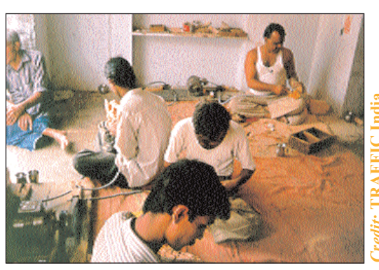
Carvers at work in India

unmatched by any other handicrafts industry and comparable to the jewel cutting and setting business. Such status reflects the high cost of ivory as a raw material: if the tusk is wrongly cut, it cannot be re-melted and cast, as in the case with precious metals and, as such, there is a need for excellent craftsmanship in order for the final product to fetch a good price. An ivory carver was accordingly an affluent person, who had learnt his craft after a long and strenuous period of training for 12 to 15 years and who subsequently enjoyed a high social status. The