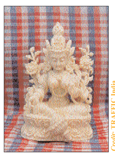
The goddess Lakshmi. Carvings of this goddess, one of the many Hindu deities fashioned in ivory in India, were found to be available in Murshidabad and Kerala.

In Murshidabad, the only location visited by the investigator in West Bengal , artisans were found still to be carving ivory according to demand and the town is allegedly a major supplier to the handicraft outlets of Kolkata, Darjeeling, Delhi, Mumbai and Nepal. The investigator saw raw ivory pieces and carved ambari (miniature embellished elephants) in Murshidabad. Many individual artisans indicated their willingness to provide ivory carvings, often offering to forward to a potential customer a photograph of carvings they were willing to manufacture. These artisans turned manufacturers-cum-traders, who employ groups of artisans, were reported