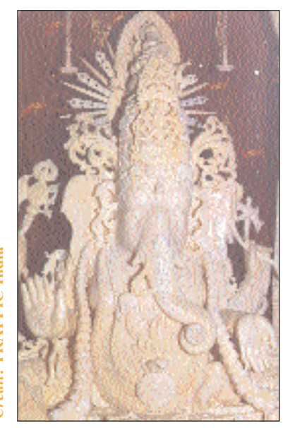
An intricate ivory carving of the god Lord Ganesh. Popular ivory items, carvings of Ganesh were reported to be available in Delhi, Jaipur, Mysore, Bhubaneshwar and in Kerala.

National and international courier agencies were reported to be involved in exporting ivory items, especially in Rajasthan and Delhi. In Udaipur, the practice of private national and international courier services exporting parcels containing ivory art works, whenever the value of the parcel was high enough to make it worth the risk, was discovered. A system of booking international parcels as samples (declared "not for sale" and substantially undervalued), their transportation to Jaipur or Delhi and their quick Customs clearance, assisted by courier agents, was reported. The courier service booking clerk is often well aquainted with emporium staff and it can be arranged so that the courier staff pack and address purchases with the buyer present. A visit to a few courier firms and to the foreign post office (a special branch of the postal service which deals with overseas post and has provision for Customs clearance prior to dispatch) revealed that handicrafts are a relatively easy thing to export in the form of a parcel. At the foreign post office there were a few efficient private agents who assisted in packing, the completion of formalities and early clearance of parcels by Customs staff. According to Customs agents, parcels cleared by Customs staff at the foreign post office could