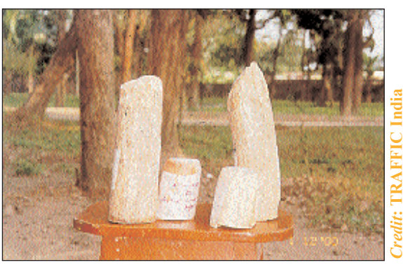
Ivory seized by police in Assam, 2000

Ivory offered for sale by tour guides in Orissa was said to be from Simlipal Wildlife Sanctuary (northern Orissa) and Chandaka Forest (near Bhubaneshwar). Wild elephants are found in forests of Orissa (see Table 1 ) and there have been seizures of raw ivory in this State (see Annex 1 ). There was also mention of Koraput District as a source of ivory by a few tourist guides and traders, although the place is not known to have any substantial population