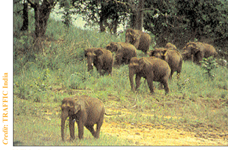
Wild elephants in India