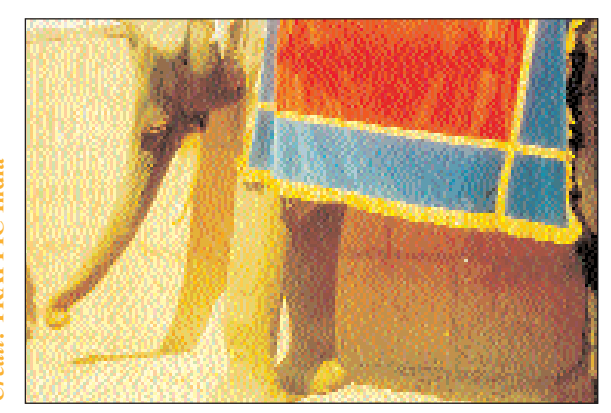
Elephant in Jaipur with one tusk missing

In Jaipur , there were reported to be about 87 registered and licensed elephants. Most of the animals were owned by the mahouts living in the Mohalla Mahavatan–Ghat gate area of the city. These animals are used to provide rides to tourists at Amer Fort, Jal Mahal and a few other places. Of these, only six or seven were tuskers. Their tusks have been apparently thoroughly exploited by their owners, as one tusk was seen to be completely missing and cutting of the tusk was evident in another case. When the tusk point is cut, it is normally about eight to 10 inches long. Thereafter, a