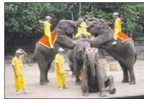
Some of China's indigenous elephants have been captured and trained as performing animals.