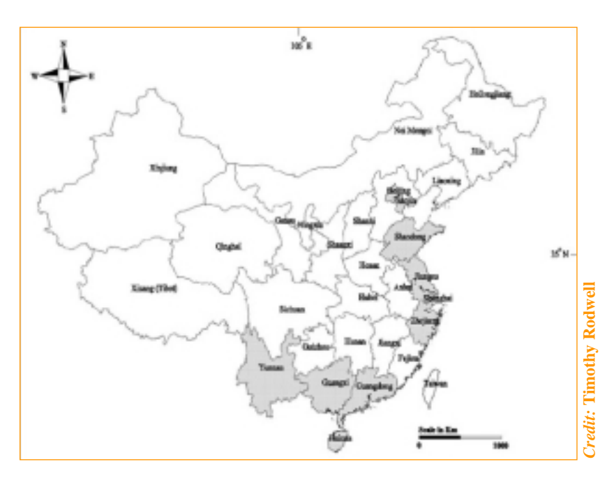
Figure 2 Location of ivory seizures in China, based on available information, 1998 to 2001