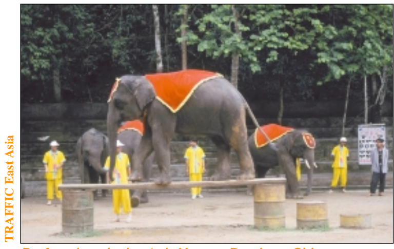
Performing elephants in Yunnan Province, China