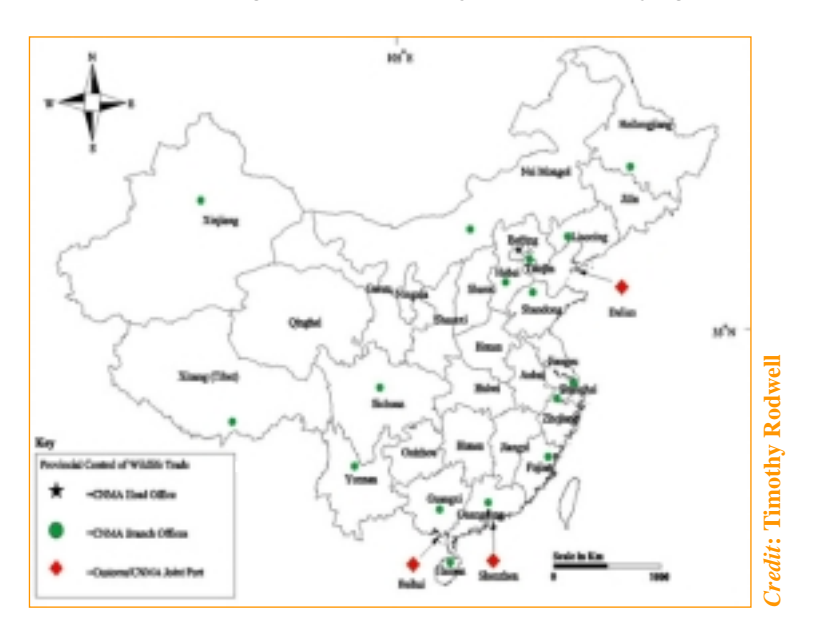
Figure 1 China CITES Management Authority (CNMA), Beijing, and branch offices of the CNMA