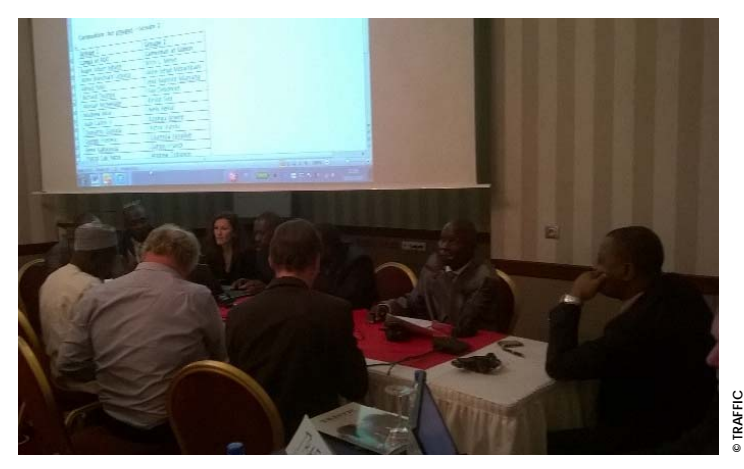
Photo 2: Group 1 – Cameroon, Gabon, Chad, CAR and other participants