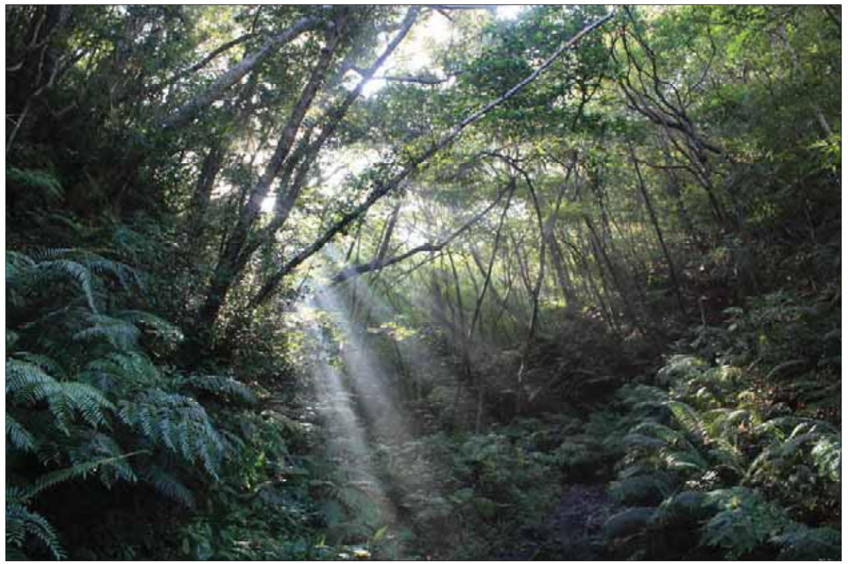
Yambaru forest, Okinawa Jima (see Figure 1)

This report provides an overview of the present situation of wildlife trade control under the existing legal system in Japan with a focus on Japanese endemic reptiles. At the same time, an attempt is made to illustrate the current levels of international trade, using China's market as a case study example.