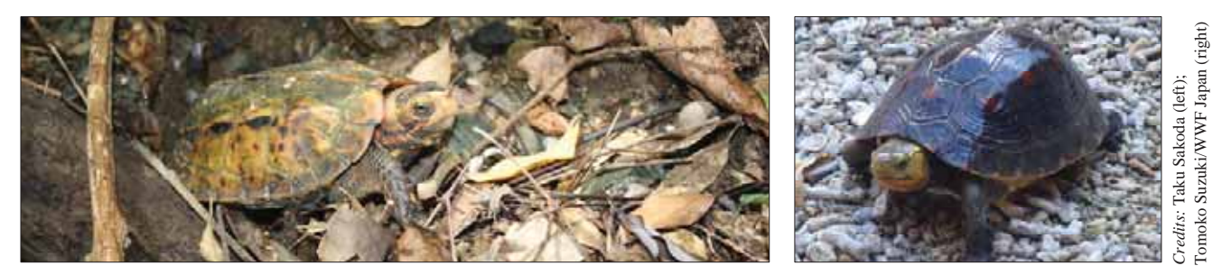
Ryukyu Black-breasted Leaf Turtle Geoemyda japonica (left) and Ryukyu Yellow-margined Box Turtle Cuora flavomarginata evelynae (right)

Three of the focal species—Ryukyu Black-breasted Leaf Turtle, Kishinoue's Giant Skink and Ryukyu Yellow-margined Box Turtle—were considered highest priority owing to their legal status in Japan and, therefore, if the researchers did not find them on sale, staff on duty were questioned as to whether the shop sold them or not.