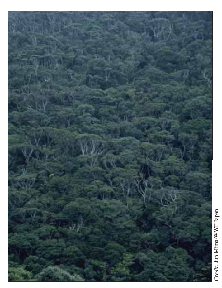
Yambaru Forest, Okinawa, Nansei Shotō

Only 11 exemptions to these regulations of the Law for the Protection of Cultural Properties have been granted between 2001 and 2012 with regard to species covered by this survey (Agency for Cultural Affairs in litt, 8 March 2012 to TRAFFIC). These cases involved Kishinoue's Giant Skink (three cases), Ryukyu Yellow-margined Box Turtle (one case), and Ryukyu Blackbreasted Leaf Turtle (nine cases) (there is a species overlap in some cases). Among these 11 cases, 10 involved applications for permission by public agencies, while the remaining case involved an application from a zoo. The majority of applications sought permission to release animals that had been caught in traps set to capture the invasive and problematic Small Asian Mongoose Herpestes javanicus (six cases), while others involved permission to handle living animals when a helipad was relocated in accordance with the return of a US military base in Okinawa to Japanese control, or to capture individual animals temporarily for academic research purposes.