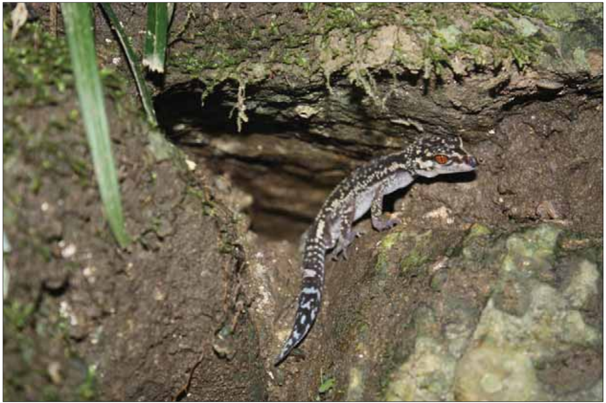
Kuroiwa's Ground Gecko Goniurosaurus kuroiwae kuroiwae

Although the common name Kuroiwa's Ground Gecko technically only refers to one of five subspecies, in this report the name is used to refer at species level, apart from where sub-specific common names are given, for example in Box 1 .