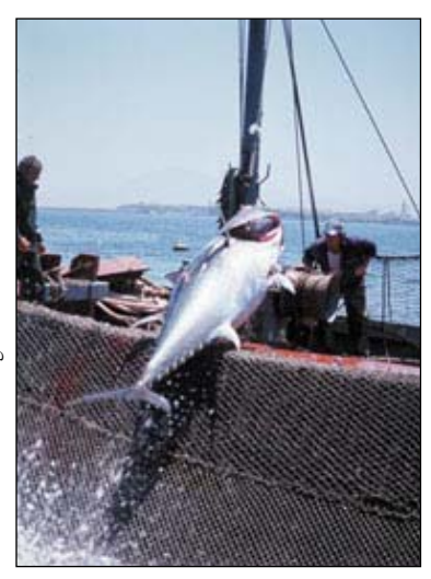
Tuna fishing off the coast of Spain

The coverage of the schemes has, however, improved over time. For example, ICCAT's original scheme for Atlantic Bluefin Tuna applied only to frozen product but has been extended to include fresh product. ICCAT's concerns about tracking the catch of live tuna for farming would be addressed if documentation were required at the point of harvest rather than export and ICCAT has work under way to establish a CDS for Atlantic Bluefin Tuna (ICCAT, 2006b).