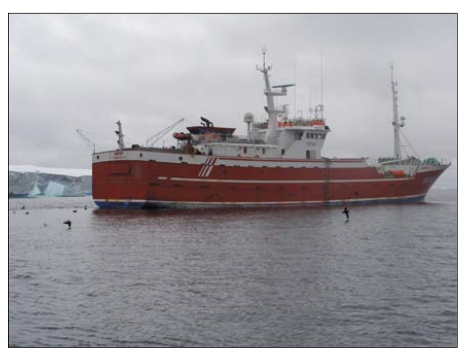
A fishing vessel in the area overseen by CCAMLR (Commission for the Conservation of Antarctic Marine Living Resources).

Experience has shown that trade-related measures have a role to play in improving catch estimates and addressing IUU fishing. However, the hard management decisions about appropriate settings of catch and effort limits, allocation of participatory rights, the use of independent observers and the development of effective and centralized MCS measures must not be neglected in the pursuit of trade-related measures to address IUU fishing. RFMOs must ensure that their efforts to minimize the impact of IUU fishing on legal operations are balanced with their other management responsibilities.