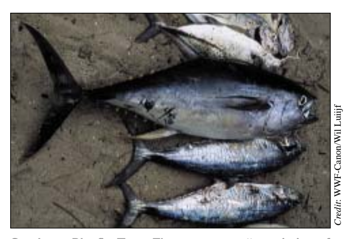
Southern Bluefin Tuna Thunnus maccoyii, a victim of shortcomings in documentation schemes

The shortcomings of TDS have been demonstrated by the recent experience in CCSBT. The CCSBT Trade Information Scheme (TIS) does not record that portion of the catch of Southern Bluefin Tuna by members or cooperating non-members that is destined for their own domestic markets. Over time, domestic consumption of Southern Bluefin Tuna has increased in catching