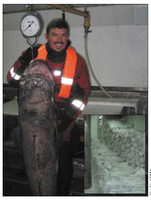
An officer of the Australian Fisheries Management Authority on inspection duty and (inset) frozen toothfish Dissostichus spp. aboard a vessel fishing in the Southern Ocean in 2006

Trade-related measures have come to be used as a package of measures. In some cases (for example, in ICCAT and the Commission for the Conservation of Southern Bluefin Tuna (CCSBT)) the primary purpose is to gather information on the