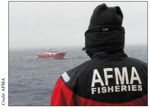
An officer of the Australian Fisheries Management Authority on patrol in the Southern Ocean

White lists sometimes apply to sub-sections of the fleet. For example, white lists may be developed for vessels of a specified length or tonnage (e.g. in ICCAT, IOTC and NAFO) or vessels fishing on the high seas (e.g. in IOTC). This provides a loophole for exploitation by IUU fishers.