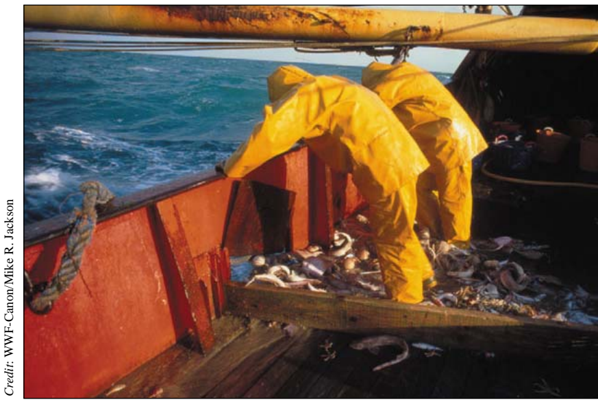
Discarded fish are pushed overboard on a deep-sea trawler: records of this harvest would not have been captured by documentation schemes

However, to date, of those RFMOs that implement documentation schemes, only CCAMLR has one supported by a centralized, albeit voluntary to date, VMS. All others report only to the flag State rather than to the RFMO as well. In addition, many VMS apply only to vessels of certain lengths rather than to all vessels. To be effective support for documentation schemes, VMS need to be centralized, to apply to all vessels catching the relevant species and to minimize opportunities for tampering. However, the broadening of membership of RFMOs to include all States involved in trading products, or with nationals active in the fishery, in addition to the traditional membership of fishing and coastal States, may reduce the likelihood of achieving such goals, since many members may have limited capacity and/or commitment to adoption of effective packages of trade control measures.