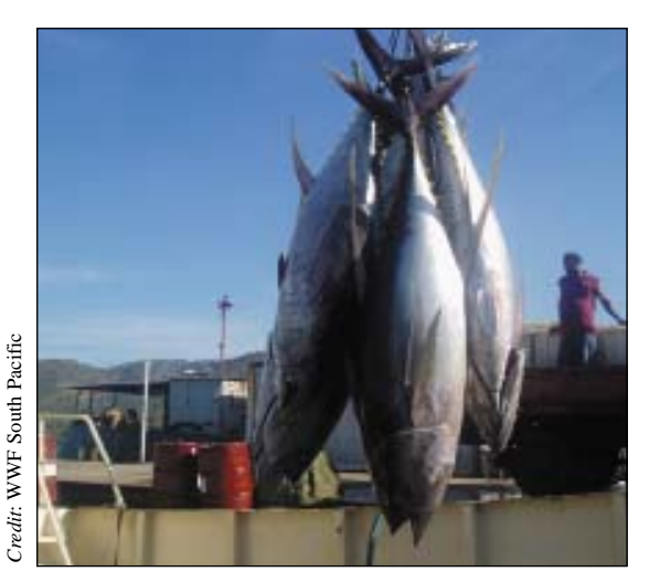
Unloading tuna in Papua New Guinea

by direct inspection in designated ports all over Europe' (NEAFC, 2006). The measures provide for prior notification of landings of frozen fish by foreign fishing vessels, including a declaration by the master of the vessel of the catch on board. Before the landings can be authorized by the port State the flag State must verify the information in the declaration and confirm that the vessel held relevant quota, that the catch had been included in quota monitoring, that the vessel was authorized to fish and that the area of catch had been verified by VMS. The new measures