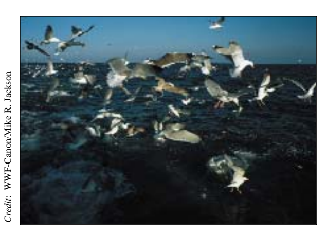
Seabirds in the wake of a deep-sea trawler in the North Atlantic feed on discarded fish which have been kicked overboard

RFMO estimates of IUU fishing are by their nature open to considerable uncertainty. Similarly, the level of authorized fishing for target species managed by RFMOs is uncertain owing largely to the unwillingness or lack of capacity of some RFMO members to submit verified catch data on a timely basis. In addition, the absence of credible observer programmes means that reliable estimates of discards and other forms of incidental mortality are generally lacking. Overall,