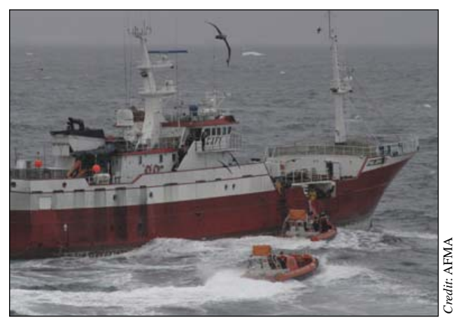
Officers of the Australian Fisheries Management Authority boarding a fishing vessel ship in December 2006 to undertake an inspection

However, even where IUU vessel lists apply in theory to both members and non-members, problems can arise. The recent experience of CCAMLR (ASOC, 2006b) highlighted the problems of adding a vessel of a contracting party to the IUU list in an environment of consensus decision-making. Under these circumstances the 'accused' flag State member of the RFMO can legitimately veto the addition of the vessel to the black list despite overwhelming evidence of its IUU activities.