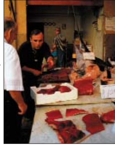
Sale of Swordfish Xiphias gladius and tuna at market in Sicily

Implementation of these improvements would help to shore up the existing paper-based documentation, however many of them would be unnecessary if an electronic documentation scheme were introduced.