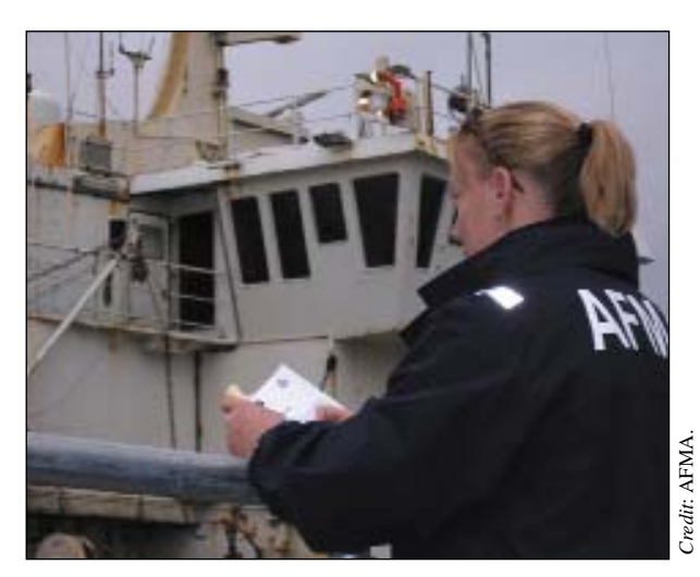
An officer of the Australian Fisheries Management Authority logs details of a fishing vessel apprehended for illegal fishing in the Australian fishing zone

Documents]' (ASOC, 2006a). Despite the reluctance CCAMLR members to mandate the use of electronic documentation, from early 2007 the second-largest importer toothfish, the USA, will unilaterally require that all toothfish imports be accompanied by electronic documentation. This should provide a strong incentive for all traders and processors to use electronic documents and demonstrates the positive role that market States can play in enforcing conservation management measures.