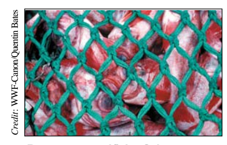
Deep-sea redfish Sebastes sp.; several thousand tonnes Sebastes spp. are landed illegally