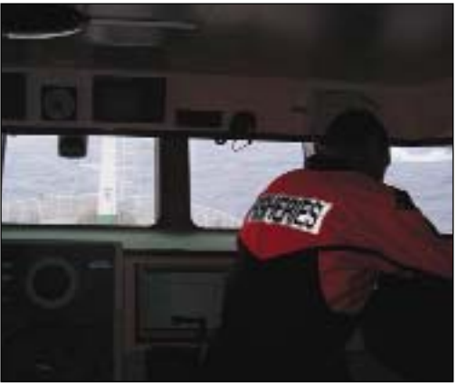
Australian fisheries inspectors on duty ashore and on the bridge of a fishing vessel

Over time, these measures have come to be used as a package of measures and, increasingly, they are supported by a range of complementary measures such as vessel monitoring systems (VMS), observer programmes and controls on transhipment.