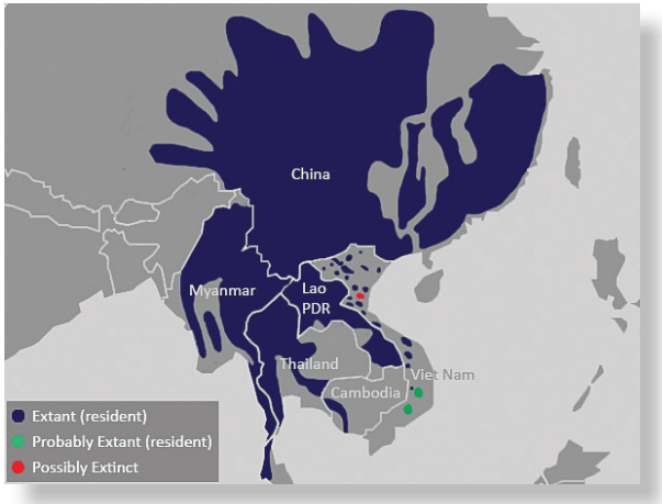
Fig. I. The distribution of Chinese Serow Capricornis milneedwardsii.

Serows in South-east Asia are threatened by widespread poaching and illegal trade. Almost everywhere they occur, they are reportedly hunted for their meat and their parts which are used in traditional medicines (Duckworth et al., 2008a; Duckworth et al., 2008b; Duckworth and Than Zaw, 2008). Serow parts have consistently been observed during surveys of wildlife trade in markets and restaurants undertaken across South-east Asia (see: Martin, 1992; Shepherd, 2001; Shepherd and Krishnasamy, 2014). The same has been observed in Lao PDR where serow parts were commonly found in trade in both rural and urban markets (Duckworth et al., 1999). Bones, feet, blood, teeth, innards and other body parts are widely used in local traditional medicine production, while the horns are coveted as trophies. There are also records of crossborder trade in serow parts from Lao PDR to China, Thailand and Viet Nam (Duckworth et al., 1999).