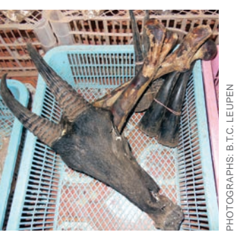
Pieces of serow skin, bone and jaw, Pakse market (left); serow frontlet, bones and horns for sale, Thongnamy (right), December 2016.

such as Sambar Deer Rusa unicolor (Duckworth, in litt., 2017) and several species of wild cattle. The current study's surveys only confirm this; serow was the only species of which items were found at nearly every traditional medicine shop surveyed. In particular, ointments purporting to contain serow were widely observed, often near containers of other serow body parts. These potions are used to heal bone fractures and can be bought for an average price of LAK15 000 (USD1.78) per small bottle. The fact that the items recorded are estimated to originate from at least 150 serows may be considered a worrying finding. It nonetheless remains unclear when these serows were poached (in the case of most medicinal serow items this may have been years ago). As a result, it is difficult to determine the potential conservation impact of the medicinal trade on this species. However, the rate at which comparably sized mammals have seen severe population declines and/or local extinctions/extirpations in Lao PDR and the fact that monitoring efforts are largely absent, are cause for concern. Therefore, increased research into the exploitation of serows for traditional medicine (including inquiries into the turnover rates of serow-based traditional medicine items) seems highly necessary in order to guide future conservation and enforcement efforts. Such research would have to start with interviews with vendors, poachers and consumers.