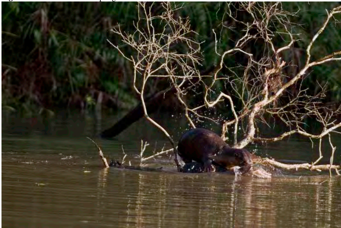
Figure 5. Otter managing to dislodge the monitor lizard from the tree, immediately jumping on its back as it hits the water.