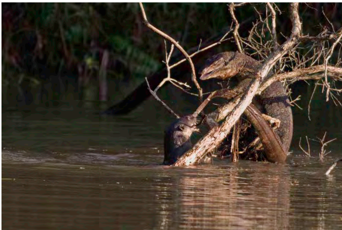
Figure 4. Monitor lizard attempting to defend itself.