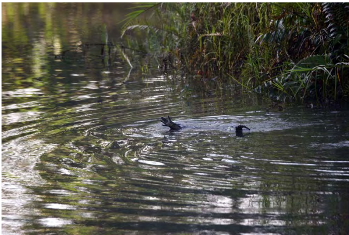
Figure 6. The monitor lizard being dragged under water during the struggle.