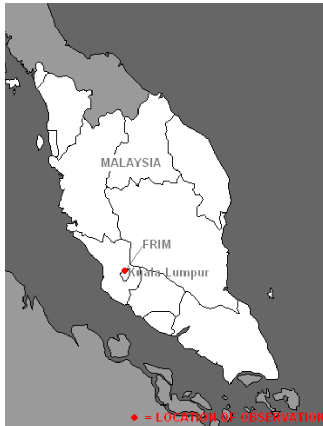
Figure 1. Location of the observation

The otter was initially observed catching and eating small fish at several locations within the pond over a half-hour period. At approximately 08:30 a large water monitor lizard, approximately 110-120 cm in length, swam across the pond and climbed onto a small tree protruding from the water (Figure 2). Within seconds the otter appeared at the base of the tree and grabbed the monitors' tail in its mouth (Figure 3). Although the monitor resisted the efforts of the otter, turning its head repeatedly as if trying to bite it (Figure 4), it was eventually pulled into the water where the otter immediately climbed onto its back (Figure 5).