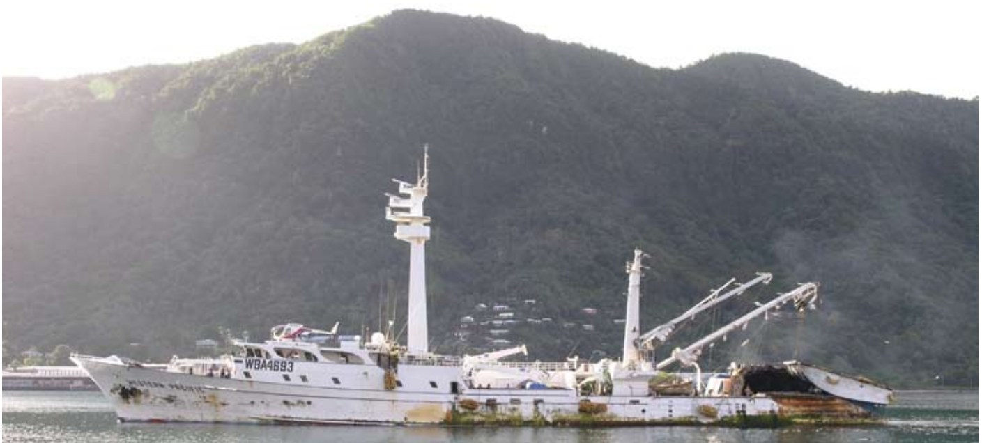
Purse Seiner, WCPFC Convention area.

Entering into force in June 2004, the Convention for the Conservation and Management of Highly Migratory Fish Stocks in the Western and Central Pacific Ocean resulted in the establishment of the most recent RFMO; the Western and Central Pacific Fisheries Commission (WCPFC). Allocation was highlighted as a crucial issue at the second negotiating session to establish the new convention, with the Chair's report stating that the Conference considered that allocation of allowable catch or levels of fishing effort was 'inextricably linked to the basic principles of conservation and management' (Anon., 1997). The issue of allocation was also one of