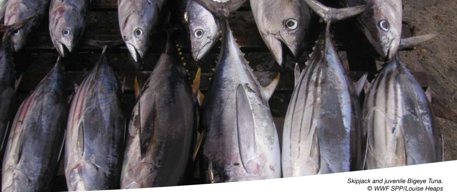
Skipjack and juvenile Bigeye Tuna.

In summary, there have been increasingly severe warnings over stock status and an absence of effective management action in response to these warnings. The second session of the WCPFC responded to advice of declining stock status by agreeing to adopt a number of resolutions, including one on the reduction of overcapacity. The same session also adopted a number of binding Conservation and Management Measures for Bigeye Tuna and Yellowfin Tuna. The degree to which these measures will be successful in the absence of an effective allocation is unclear. The level of fishing effort and catch set under the measures is also a matter of concern. These issues will be considered later in this paper.