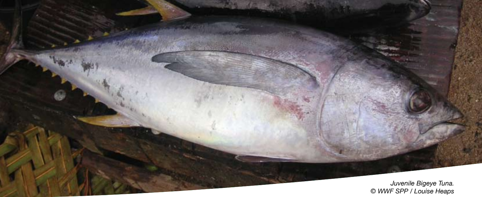
Juvenile Bigeye Tuna.

initiated a 'push back' by other FFA States on the VMS issue and subsequent increased uptake of the equipment (pers. obs.).