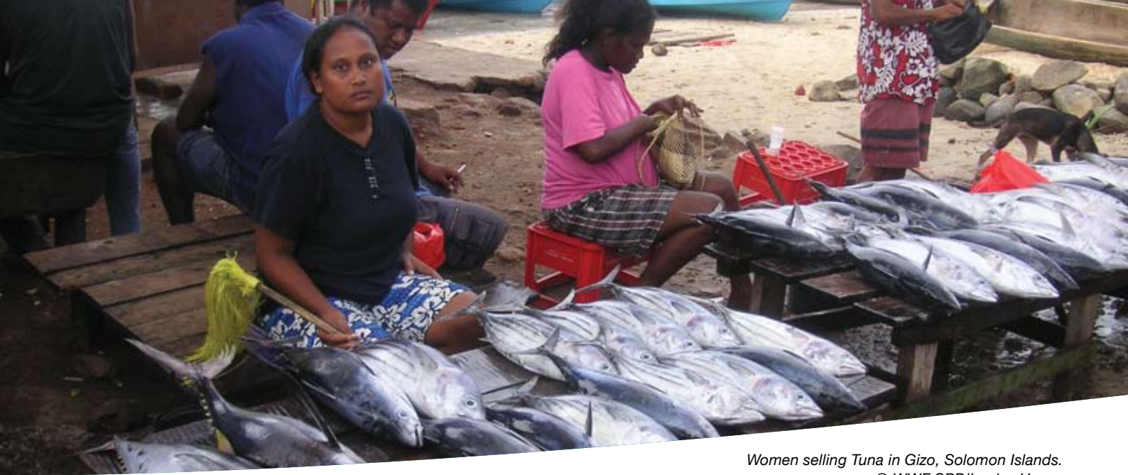
Women selling Tuna in Gizo, Solomon Islands.

six key issues identified by the Chair for discussion at the fourth negotiating session, along with the Convention Area, minimum terms and conditions for fishing, enforcement, institutional arrangements, and decision-making and settlement of disputes (Anon., 1999).