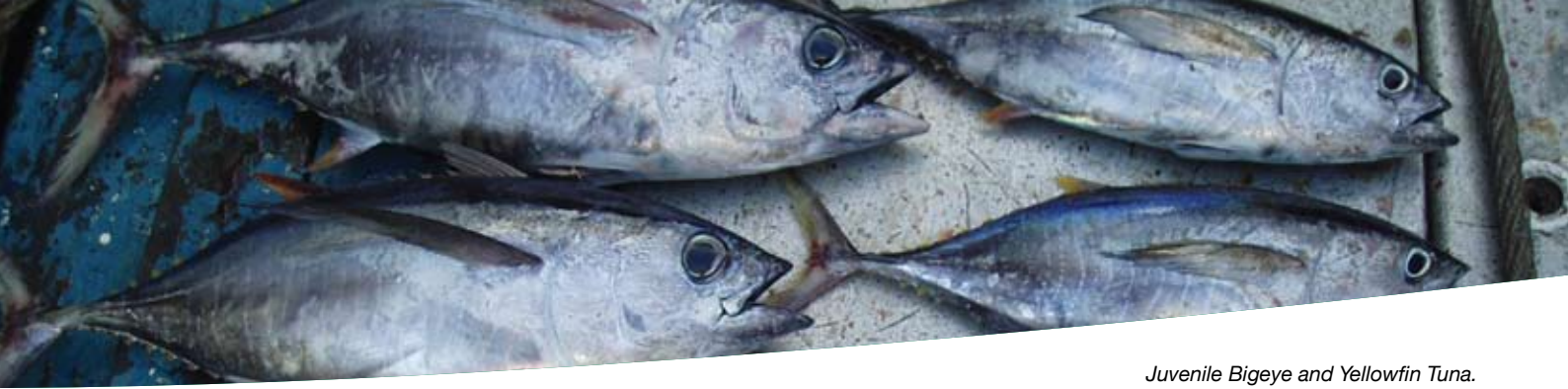
Juvenile Bigeye and Yellowfin Tuna.

by States with national allocations. It would appear that States almost universally take the attitude that where the level of catch or fishing effort by their fleet exceeds their national allocation the only viable solution is to fight to gain an increased allocation – regardless of the conservation status of the target stocks or any wider environmental impacts of higher fishing activity.