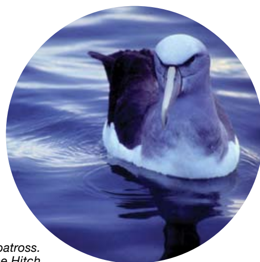
Salvin's Albatross.