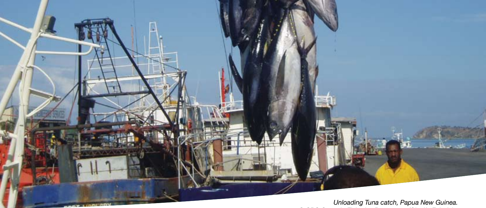
Unloading Tuna catch, Papua New Guinea.

Clearly, allocations in and of themselves will not deliver the required conservation outcomes or stability for the fishery. If the integrity of the allocations is not supported by well-developed monitoring, control and surveillance measures, non-compliance can be expected to be high with resultant negative impacts on the resource. The ability to impose some form of sanctions or penalties linked to non-compliance with quotas, or indeed reductions in quota as a response to other breaches of Members' broader obligations, should be regarded as an integral component of any allocation of participatory rights. In addition, the impact on both target stocks and the broader marine environment of both the nature of the right and the dynamics of any transferability provisions will require constant monitoring.