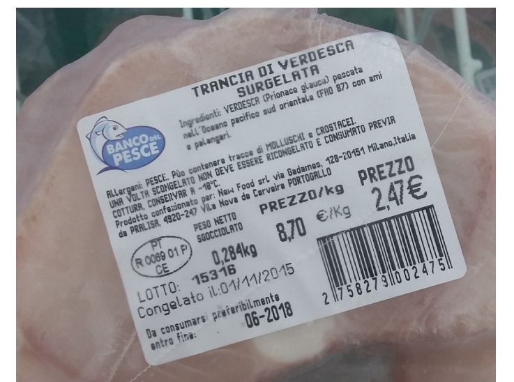
Frozen Blue Shark ( Prionace glauca) meat in a Milan, Italy retail outlet, caught using longline in FAO area 87.

As a result of this recommendation and discussions at SC66 in 2016 (SC66 SR, Para 34.), the Parties at CoP17 will consider adopting a Decision which directs, inter alia , the SC to recommend a definition of traceability, provide guidance on a governance structure, and develop umbrella guidelines and standards, all of which would be posted on the CITES website. Also, the draft Decision requests the SC to draft a Resolution on traceability for consideration at CoP18.