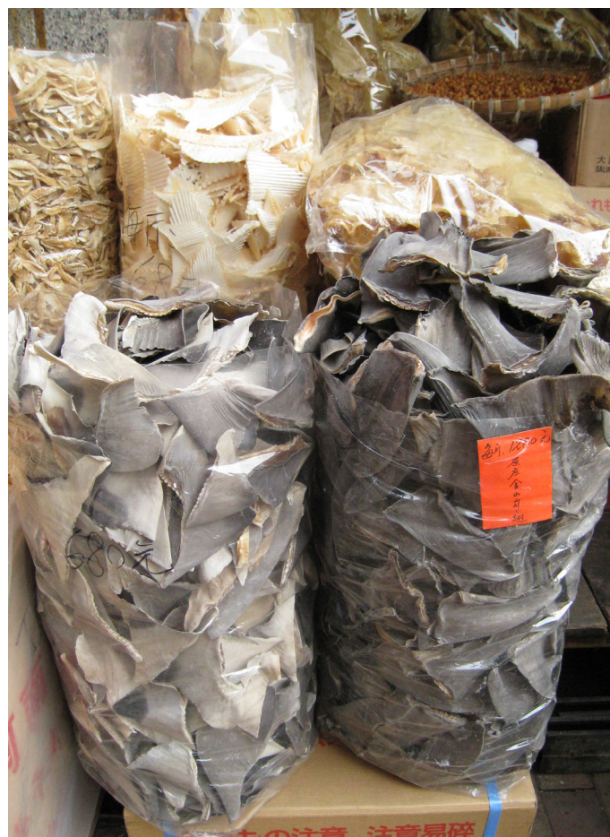
Dried shark fin in Hong Kong retail store. Red label on bag of fins reads Jin Shan Gou Fin (which means: gold mountain caudal fin).