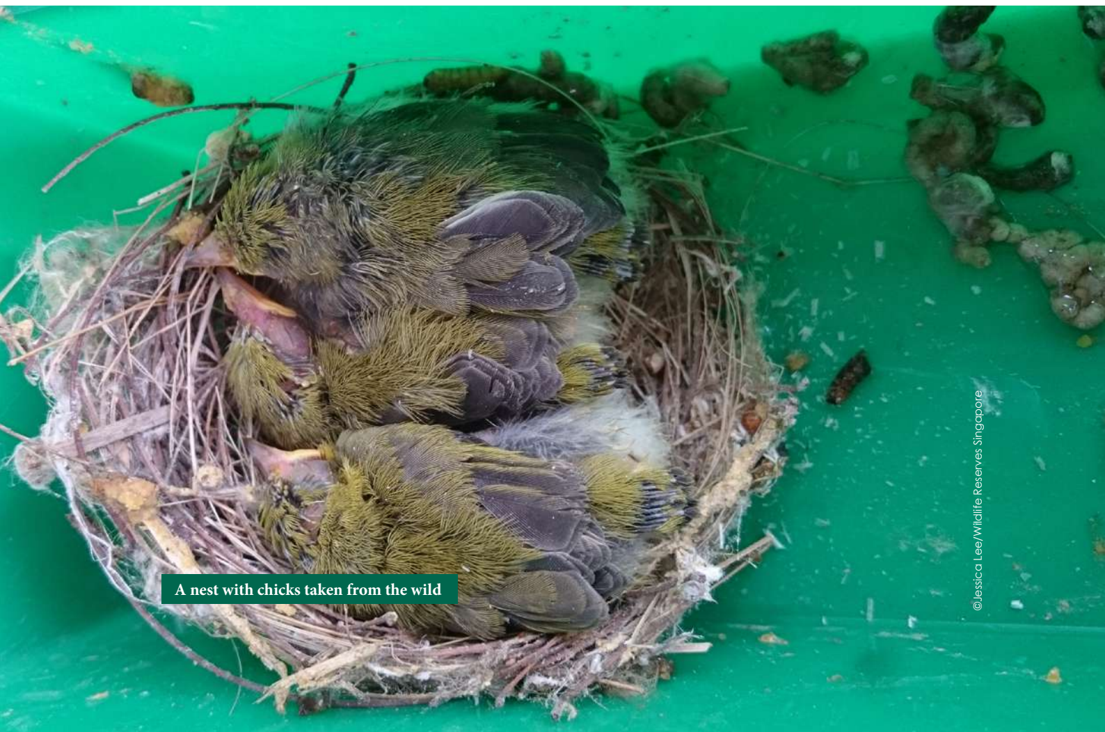
A nest with chicks taken from the wild

Circular 47/2012/TT-BNNPTNT Regulating the Management of wild exploitation and farming of common wild animals applies to nine bird species, of which one was observed in this study. These species can be collected from the wild and/or farmed when permits have been issued for each individual case of collection from the wild, or species bred. This offers opportunity for law enforcement action in the case of unpermitted trade of these nine species. However, the capacity of permitting and monitoring the application of this circular by the implementing authorities—the Viet Nam Administration of Forestry and the Forest Protection Department (under the Ministry of Agriculture and Rural Development) and the local People’s Committees—are unclear. The development of a regulatory framework for the permitting and certification of captive breeding of birds, including species not listed under Circular 47, would allow for improved monitoring of commercial captive breeding activities and regulate off-take of parent stock, eggs and chicks from the wild.