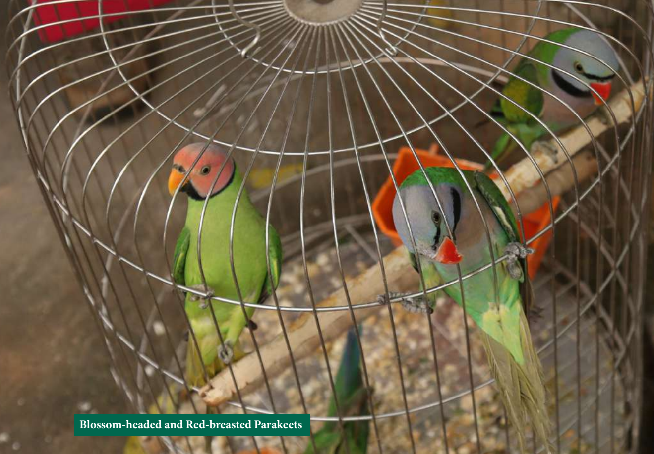
Blossom-headed and Red-breasted Parakeets