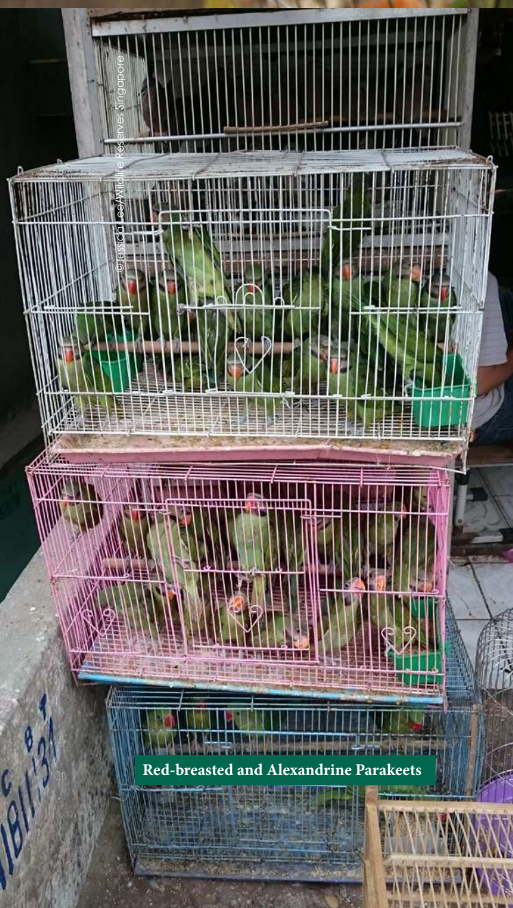
Red-breasted and Alexandrine Parakeets