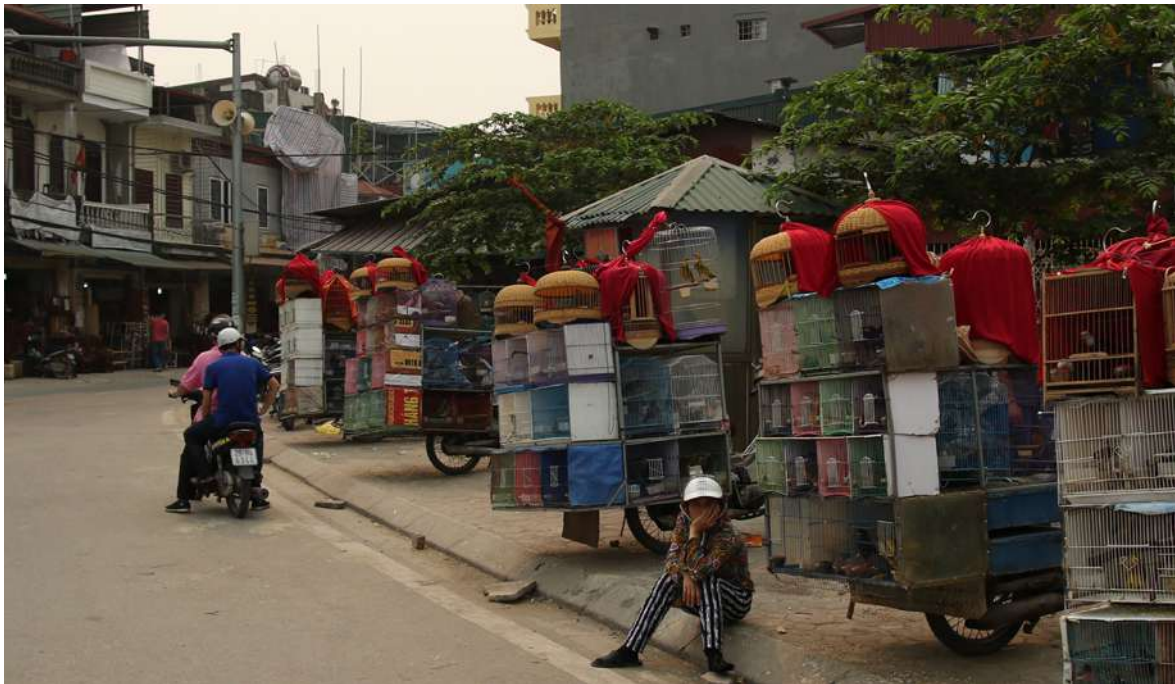
Mobile sellers on motorcycles peddling birds

On 15–17 April 2016, researchers carried out surveys of all known bird vendors in Ha Noi and HCMC, the two largest cities in Viet Nam. In each of these cities, the trade of birds takes place largely from shops or vendors in specific areas—in both Ha Noi and HCMC, one main street accounted for most of the vendors (Hoang Hoa Tham in Ha Noi, and Truong Chinh in HCMC), plus there were a few other locations across the city. Additionally, Son Tay, a city on the outskirts of Ha Noi, had several shops. Data from Son Tay are combined with data from Ha Noi in this report. A number of mobile sellers on motorcycles also peddle birds; they were found to congregate around the main streets where birds were sold, which were also included in the survey.