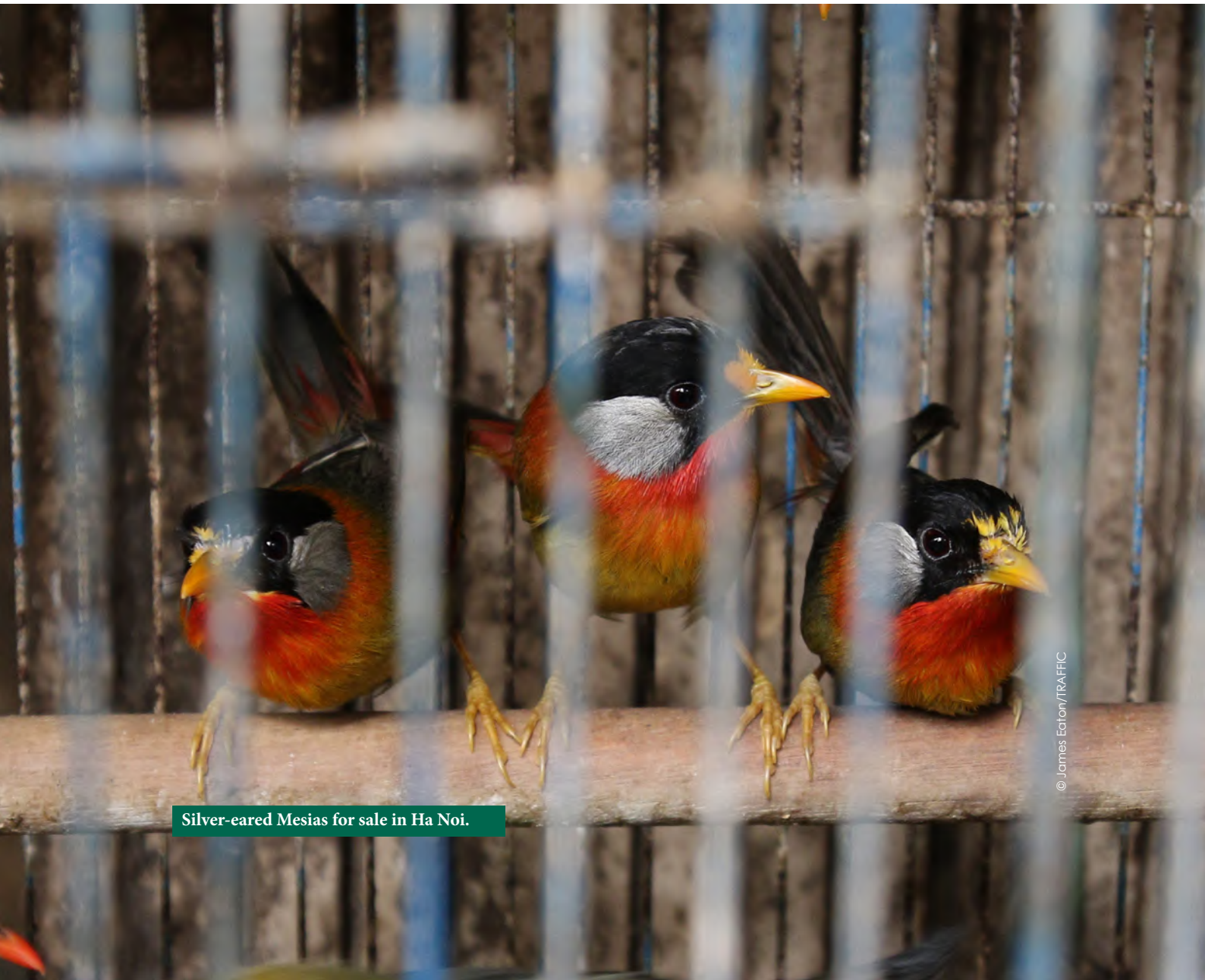
Silver-eared Mesias for sale in Ha Noi.