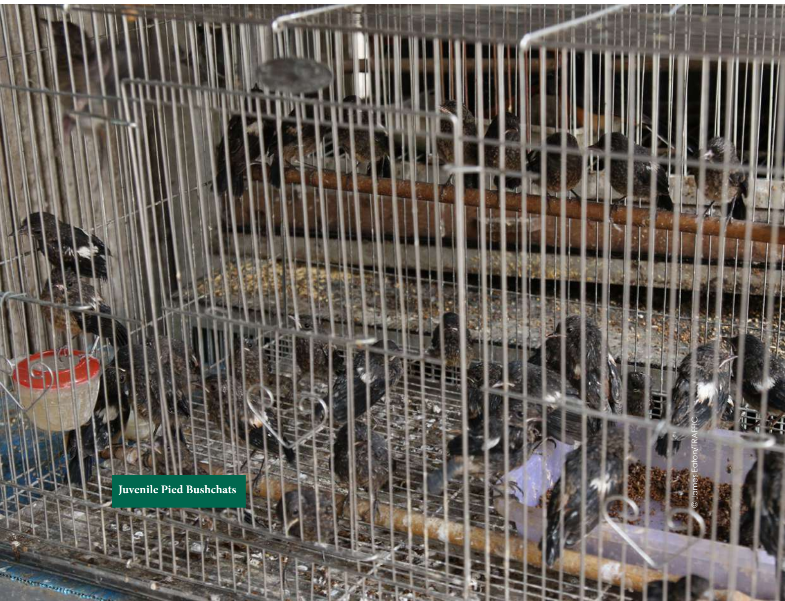
Juvenile Pied Bushchats

Surprisingly, as very few other juvenile passerines were observed in this survey, 94% of the Pied Bush Chats Saxicola caprata observed (363 out of 386 individuals) were still in juvenile plumage; this suggests that the species are specifically targeted for the songbird trade and were suspected to be ranched as many of them appeared to be of similar age and could be easily obtained from wild nests (see Discussion - Ranching). A small number of Oriental Skylark Alauda gulgula fledglings were also observed, suggesting they could be sourced from ranched birds.