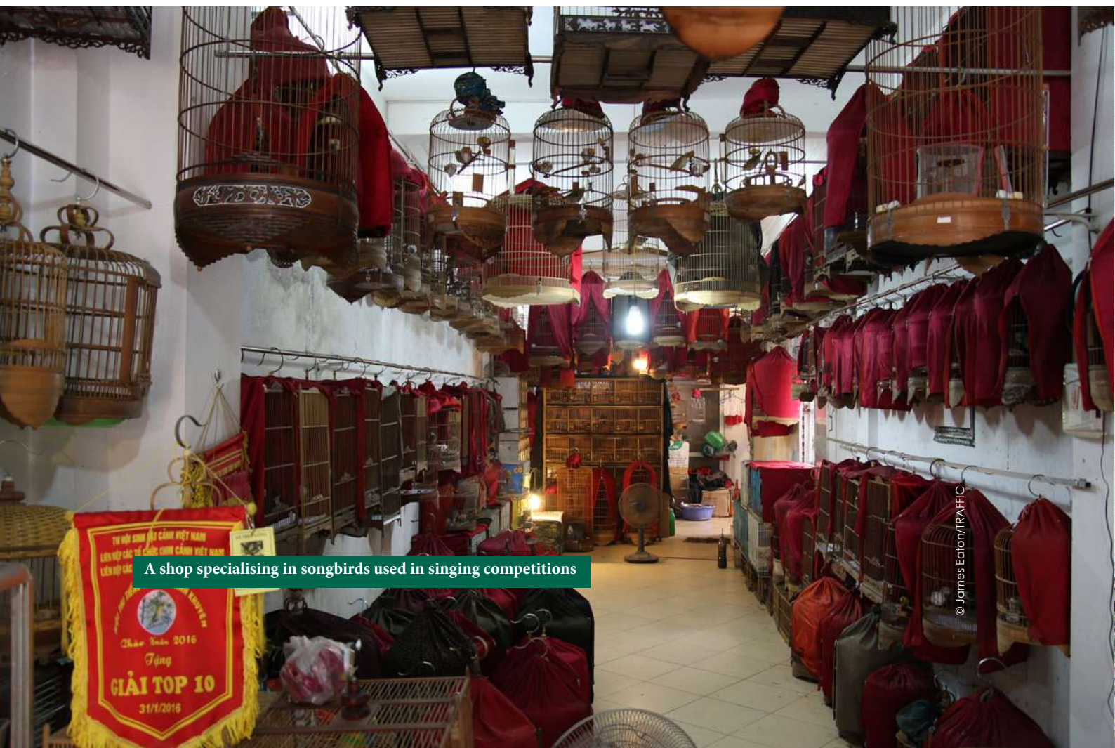
A shop specialising in songbirds used in singing competitions