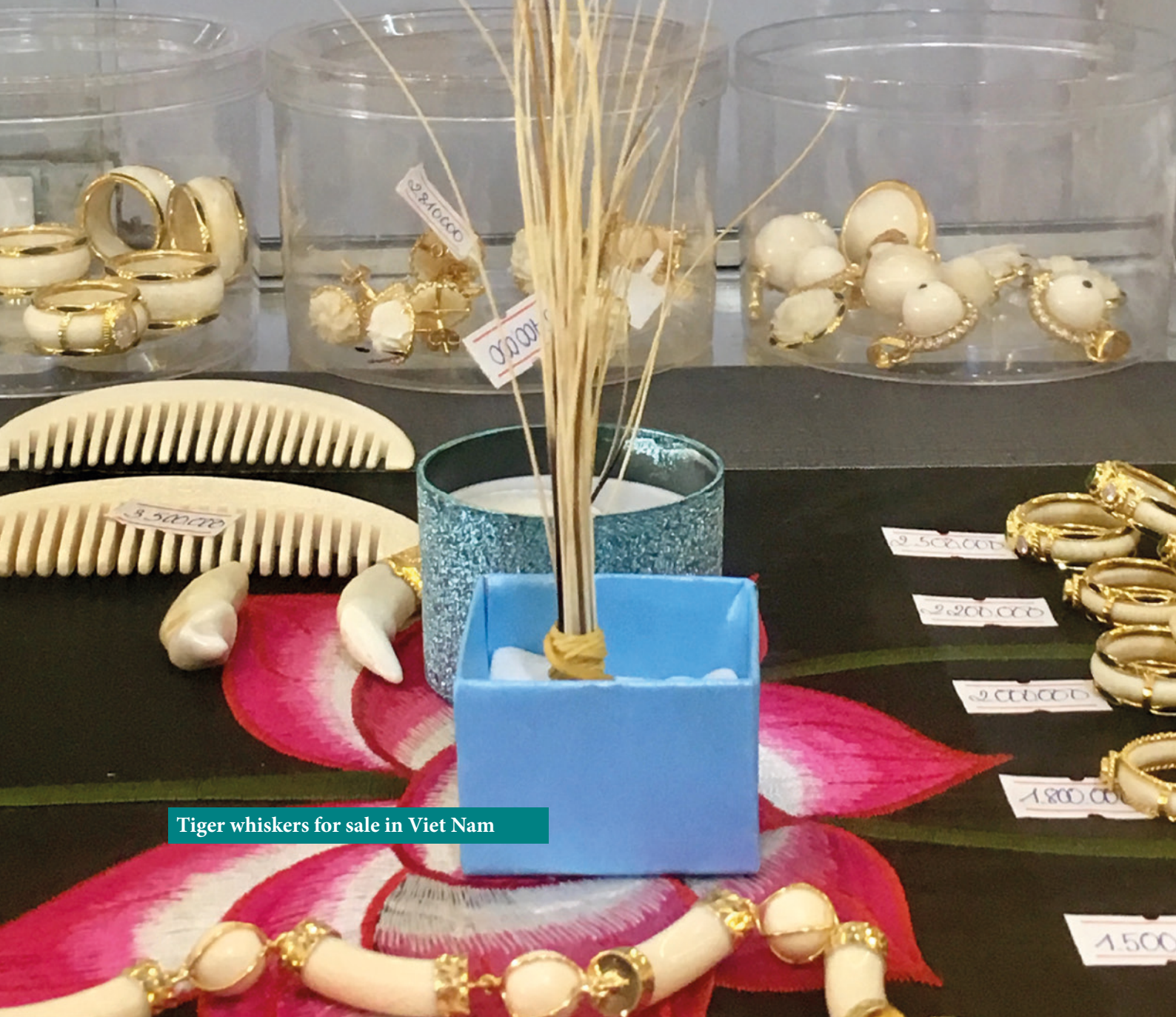
Tiger whiskers for sale in Viet Nam

Although the data from the three surveys analysed here covered 13 websites, some of them on multiple occasions, the prevalence of wildlife items for sale was low compared to data collected on Vietnamese-language websites with commercial domain names (".com") and social media platforms during the same or similar timeframes (see e.g. Indraswari et al. in prep.; Nguyen et al. , in prep.; Indenbaum, in prep.). While trade is occurring on websites with Vietnamese country domains, future research into the online trade in wildlife in Viet Nam should include commercial (formalised and/or registered) and social media websites.