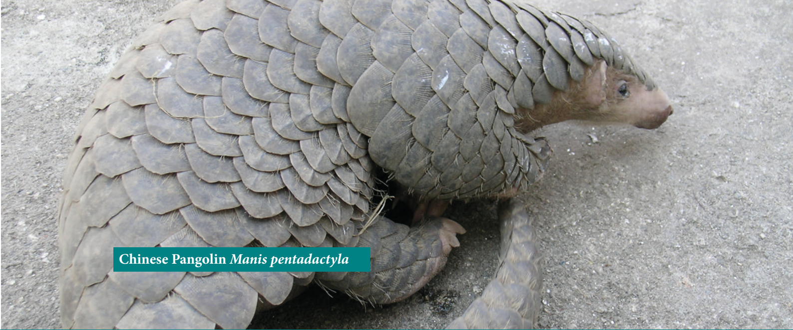
Chinese Pangolin Manis pentadactyla