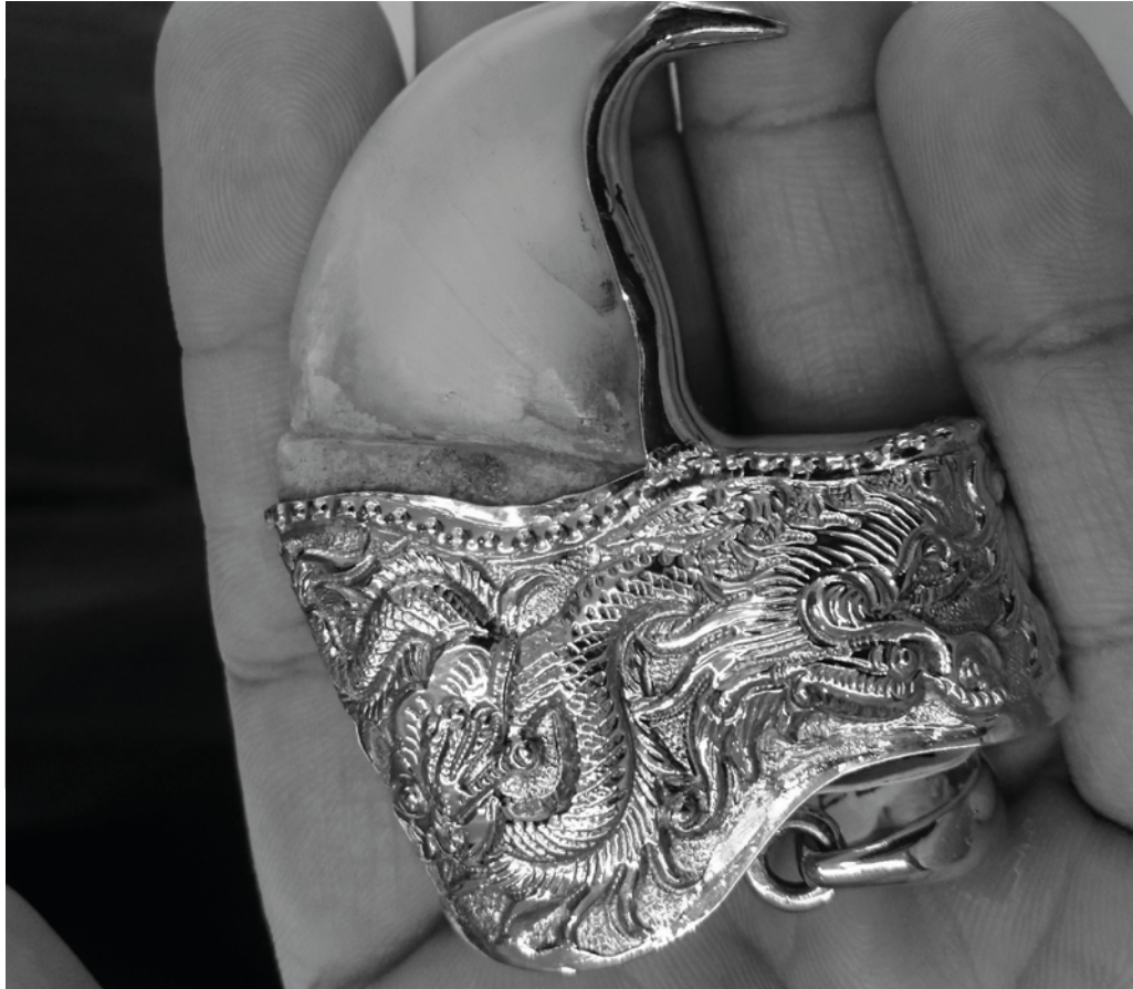
An ornamental Tiger claw for sale in Viet Nam