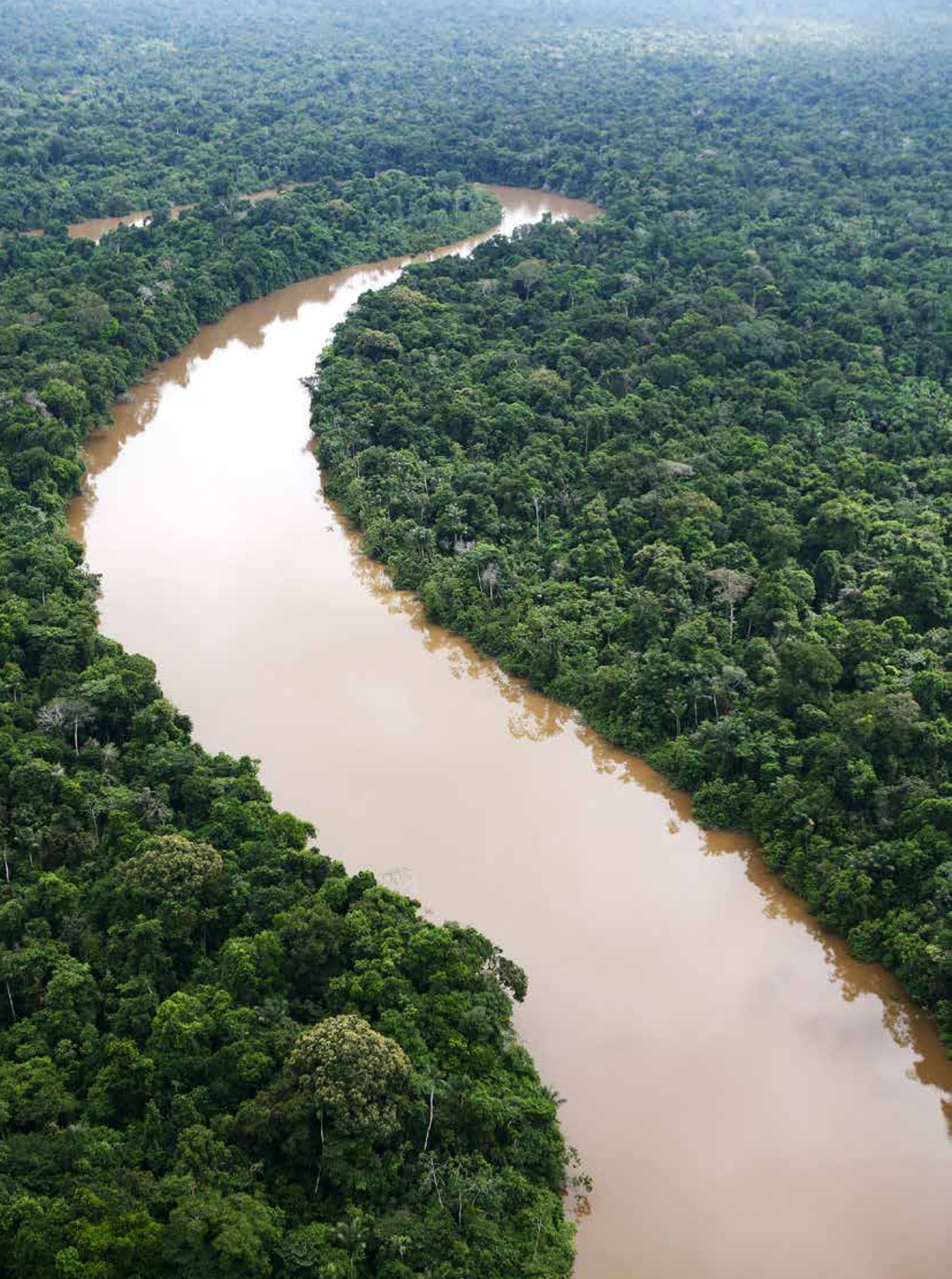
The Amazon rain forest. Loreto region, Peru.