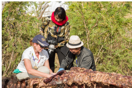
Figure 5: Tissue sample from rhinoceros carcass