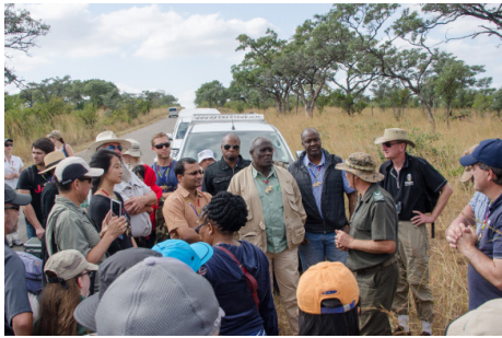
Figure 3: Poached rhinoceros briefing

The second component for this session focused on collecting suitable biological samples from the field from a poached rhinoceros carcass. Given the frequency of rhinoceros poaching in Kruger National Park (an average of just under 3 animals per day) a suitable carcass (from a double rhinoceros poaching incident) was identified and the area was secured and forensically processed in advance to give all meeting delegates access and allow them to fully experience the challenges of the field. International laboratory delegates were again given the opportunity to carry out the sampling from the rhinoceros carcass and use the eRhODIS® Forensic App developed to be used in conjunction with DNA sampling kits to ensure the continuity of the evidence from a legal perspective. eRhODIS™ was developed as an adjunct for RhODIS® to aid in the collection of samples and information relevant to the RhODIS® project and is already in use in Namibia and Kenya.