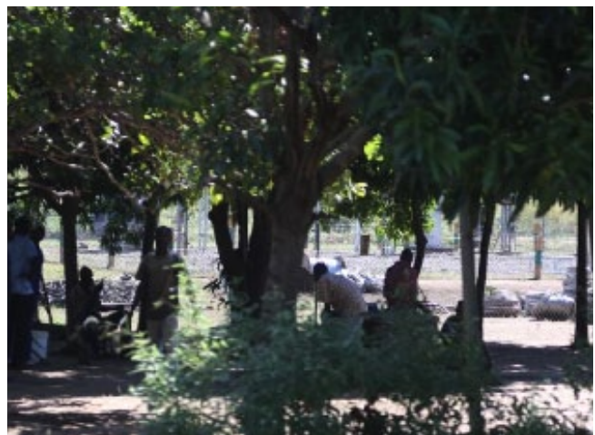
Unsecured electrical cable (Zambia Electrical Supply Corporation)