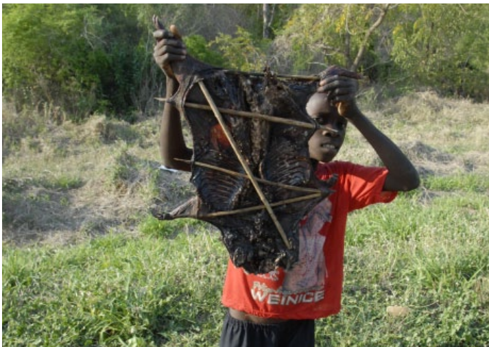
Child selling dried bushmeat on a roadside in central Mozambique