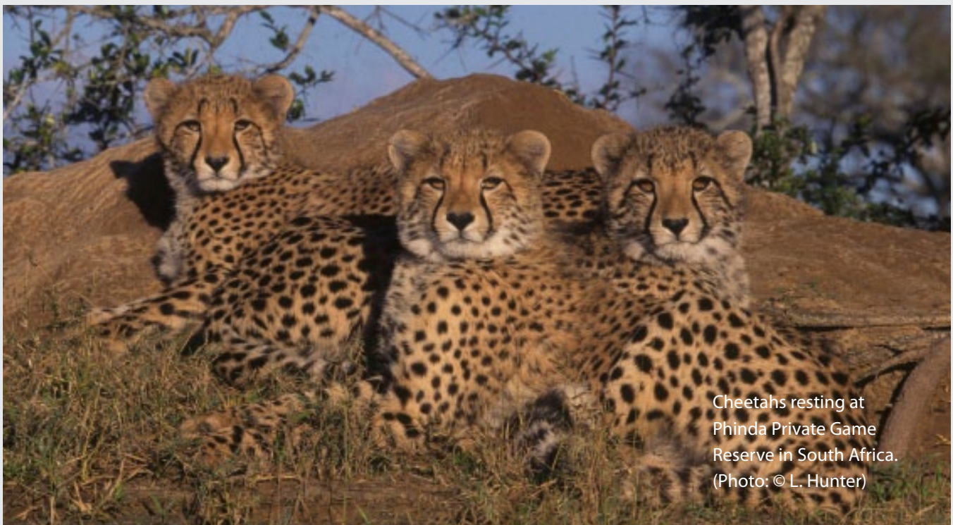
Cheetahs resting at Phinda Private Game Reserve in South Africa.

Hunting of wildlife is regulated in most African countries through wildlife legislation and permitting systems which specify restrictions on the times and places that hunting is permitted, the species that may be hunted and the hunting methods that may be used. The large majority of hunting for bushmeat contravenes one or more such restrictions. Snaring is the most common illegal hunting method and is particularly undesirable from a conservation perspective as it is highly effective, difficult to control, unselective in terms of the genders or species of animals captured, wasteful, and has severe animal welfare implications due to the manner of capture and confinement, and frequent incidents of severe, non-lethal wounding of wildlife. Other common bushmeat hunting methods include the use of rifles, muzzle-loaders, shotguns, dogs, fire, and in some cases, gin traps, pitfall traps and poison.