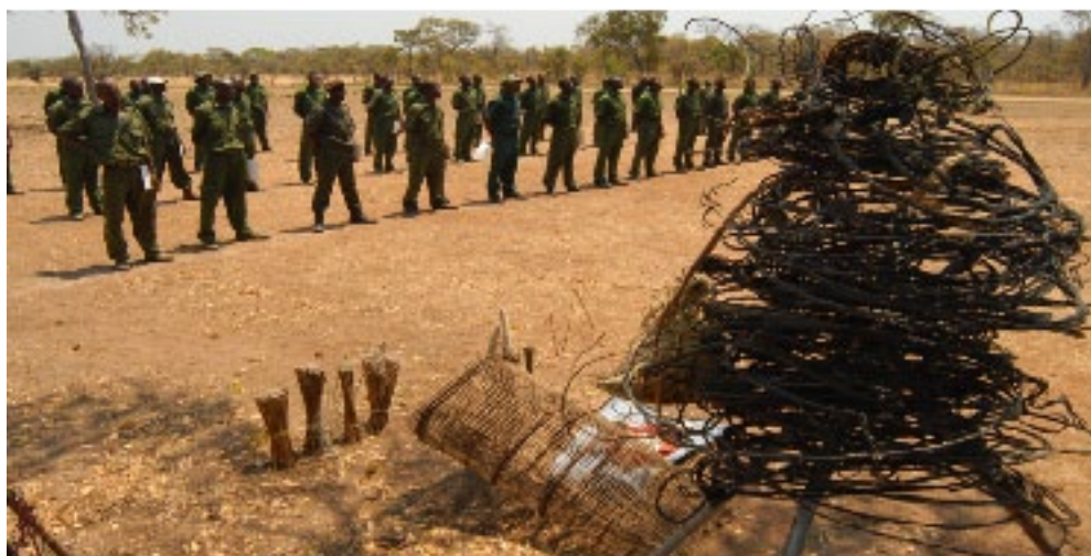
Elevated investment in anti-poaching security is needed in many wildlife areas

There are also challenges associated with the practical implementation of anti-poaching. Anti-poaching is expensive, specialized and can create animosity if not handled in a sensitive manner and if not coupled with efforts to extend benefits from wildlife to communities (Keane et al., 2008).