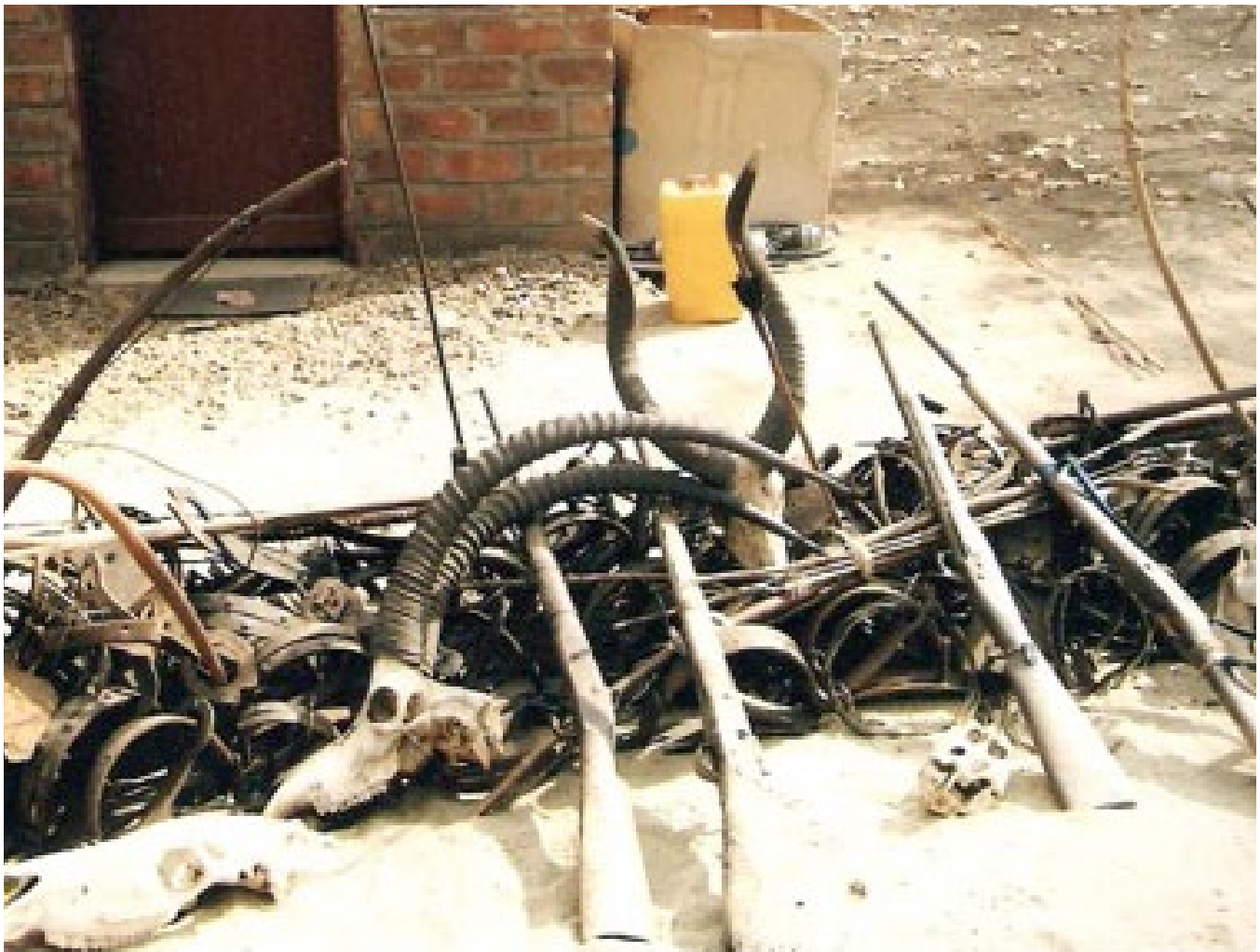
An array of poachers tools (including home-made muzzle-loader firearms) confiscated from illegal hunters in Coutada 9, Mozambique

The effectiveness of efforts to replace bushmeat consumption with alternative protein supplies may be increased by interventions designed to increase the price and/or reduce the supply of the former. In rural areas, bushmeat is typically preferred because of its availability and cheapness (Barnett, 1998), and so undermining those qualities could reduce consumption. The supply (and thus the price) of bushmeat could be curtailed by providing hunters with alternative livelihood options, through elevated anti-poaching efforts and through imposing controls on the transport of bushmeat. In urban areas where preference for bushmeat is driven primarily by taste, key interventions are likely to be providing legal and sustainable supply of game meat while increasing the price of illegal bushmeat through controls on supply of the commodity.