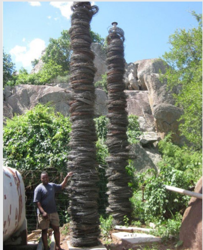
Snares removed from a single ranch in Savé Valley Conservancy, mostly comprised of wire stolen from the perimeter wildlife-proof fence.

and the methods commonly used by bushmeat hunters are typically illegal (Table 1). Hunting for bushmeat is typically illegal in many of the contexts in which it occurs due to varying combinations of: lack of licenses/permits; being practised in areas where hunting is prohibited; the use of prohibited methods; and the killing of protected species, sexes or ages of animals. Bushmeat hunting is thus hereafter referred to as 'illegal hunting'. The term 'bushmeat' is used to describe meat from wildlife that has been acquired via illegal hunting, whereas 'game meat' is used to describe meat from wildlife that has been hunted legally.