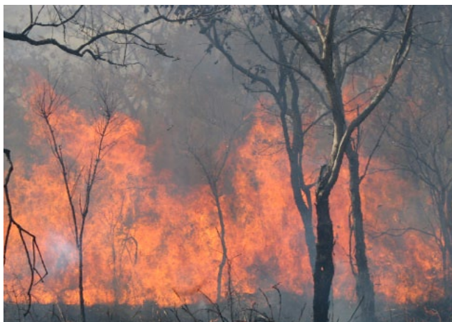
Fire set by illegal hunters, Coutada 9, Mozambique. Elephant caught in a gin trap, Coutada 9, Mozambique

There are consistent temporal patterns in the frequency of bushmeat hunting. In some areas peaks occur in the late dry season when wildlife is concentrated around water sources (Brown, 2007; Holmern et al., 2007; Lindsey et al., 2011). Bushmeat hunting is also affected by patterns in agricultural activity which dictate household food availability and the amount of time people have available for hunting (Muchaal and Ngandjui, 1999; Lindsey et al., 2011). In the Serengeti NP, the frequency of bushmeat hunting increases during the passage of migratory wildebeest Connochaetes taurinus (Holmern et al., 2007). In Savé Valley Conservancy and Mun-ya-wana there are peaks in hunting with dogs during periods of moonlight, when hunters are more able to see and (in the case of Mun-ya-wana) on rainy nights, presumably due to reduced risks of being apprehended (Lindsey et al., 2011); J. Mattheus, pers. comm.).