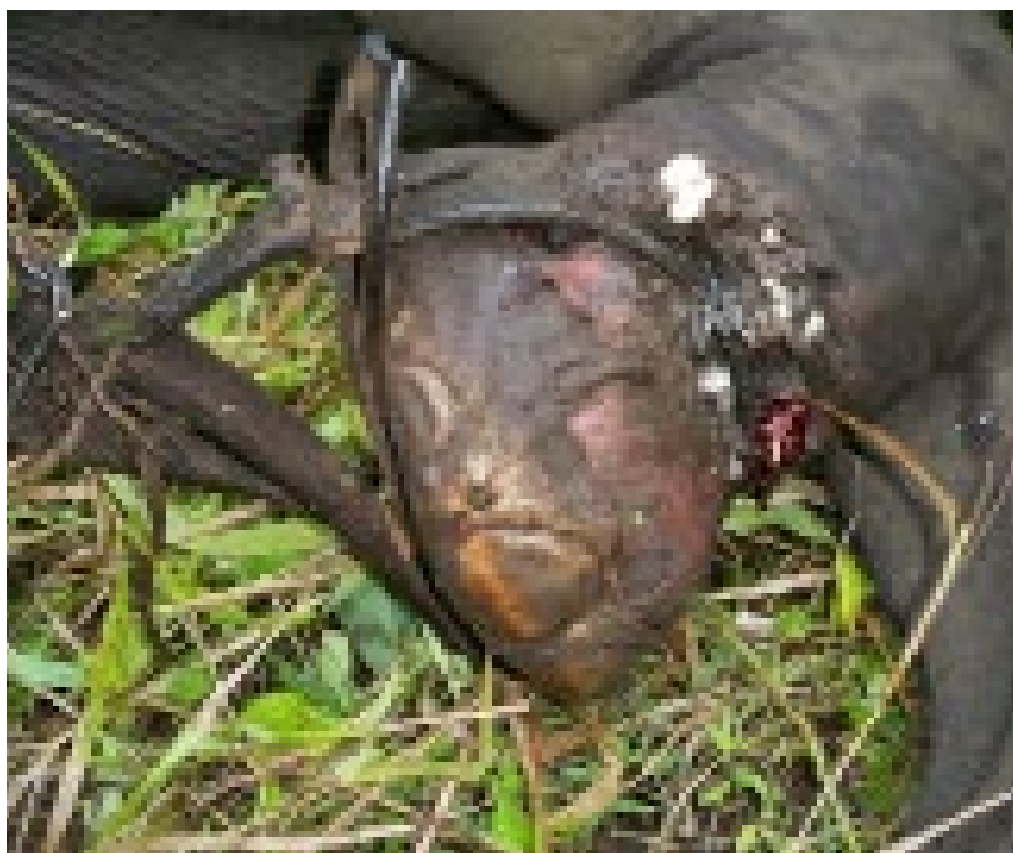
Elephant caught in gin trap

in reduction in trophy revenues from Burigi and Biharamulo Game Reserves from US$103,100 in 1994 to US$33,670 in 1998 (Jambiya et al., 2007). Ecotourism operations are likely to be even more sensitive to illegal hunting, because the viability of such operations is typically dependent on the presence of high densities of habituated wildlife (Lindsey et al., 2006). For example, in the Makuleke concession of Kruger National Park in South Africa, ecotourism operators (and the community owners of the land) ran at a loss for the first six years of operation due to depleted wildlife populations resulting from illegal hunting (C. Roche, Wilderness Safaris, pers. comm.). Animals with snare wounds also have potential to create significant negative publicity for tourism companies and wildlife destinations.