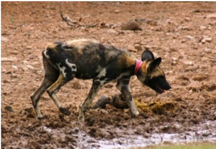
Wild dog severely wounded by a snare, South East Lowveld, Zimbabwe

Reducing the availability of wire in areas in which it is freely available, and limiting the introduction of wire in areas where the commodity is largely absent are key steps for controlling snaring. Fencing constructed from barbed or steel wire is a major source of snare-wire. If fencing is constructed with mesh (Bonnox/Veldspan™) fencing, the kinked wire cannot readily be used to make snares and the risk of wire theft by illegal hunters for making snares is lower (Lindsey et al., 2012). In many cases, wire for electricity or telephone cables is often left in bundles that are unguarded, providing easy targets for theft for making snares. Reducing the supply of wire could potentially be achieved by raising awareness among governments, industry, business and landowners about the negative environmental impacts of wire, promoting the use of mesh rather than steel-wire fencing, and the importance of securing wire bundles to ensure that they cannot readily be stolen.