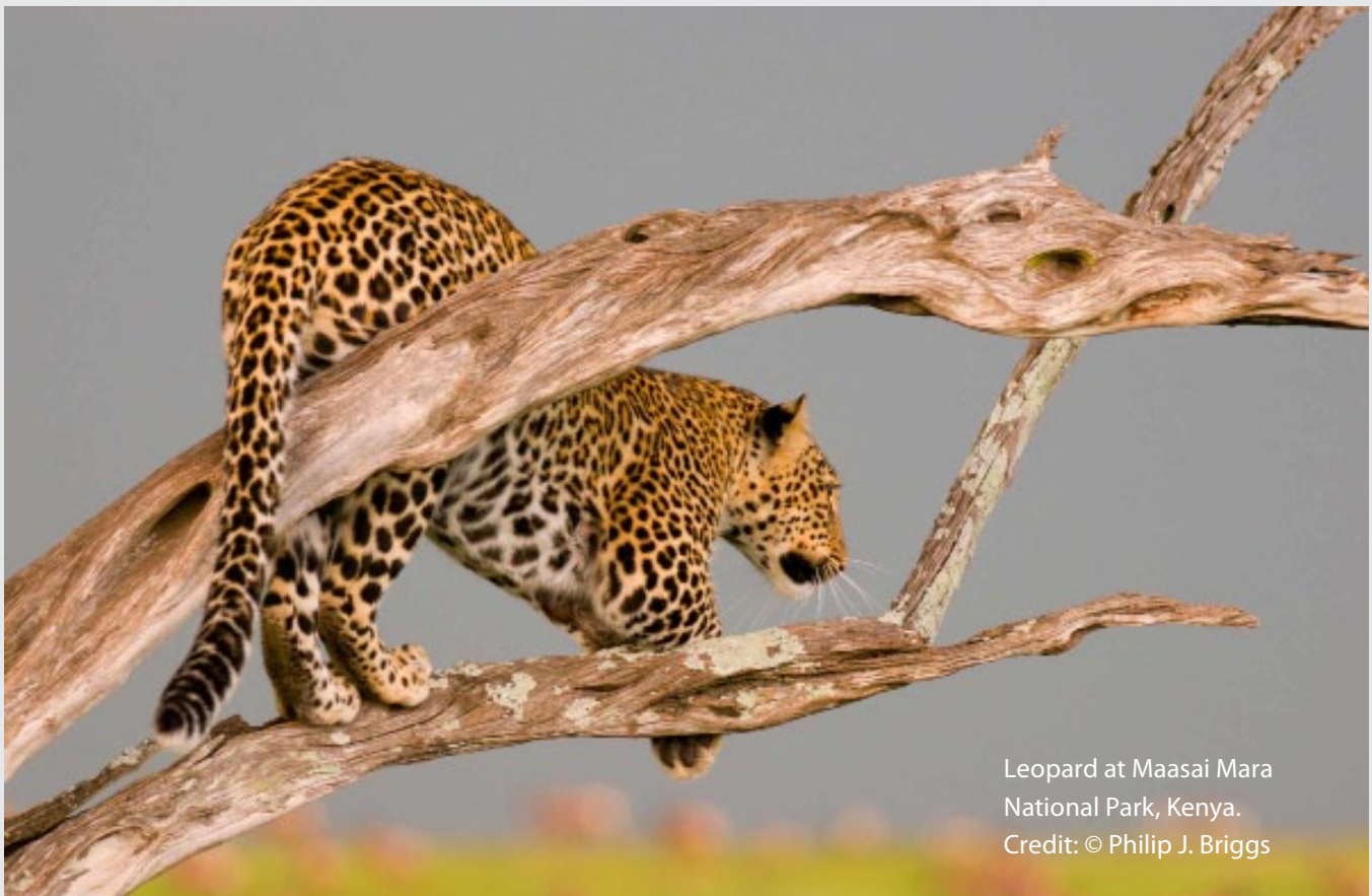
Leopard at Maasai Mara National Park, Kenya.

Urgent efforts are required to raise awareness among policy-makers and the international and donor communities of the severity and urgency of the threat posed by illegal hunting and the bushmeat trade. Failure to address the problem will have dire consequences for biodiversity conservation, will preclude the sustainable use of wildlife as a development option and have long term negative impacts on food security.