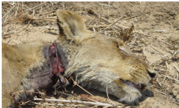
Lion killed in a snare, Luangwa Valley, Zambia