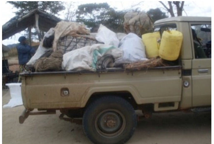
Bushmeat being transported by bicycle, central Mozambique. Bushmeat that was confiscated by traders who were transporting it by car, Zambia

The degree of secrecy with which bushmeat is traded likely reflects the quality of enforcement and degree of risk associated with the trade. In rural Maputo District, bushmeat is often traded in open-air markets, suggesting that enforcement and fear of reprisal among traders is minimal (Barnett, 1998). In Central Mozambique, by contrast, children are often used to sell bushmeat along roads as they are likely to be treated leniently by the authorities (C. Bento, unpublished data). Generally, however, in southern Africa, bushmeat is traded covertly, suggesting that there is at least some degree of enforcement in most countries (Barnett, 1998).