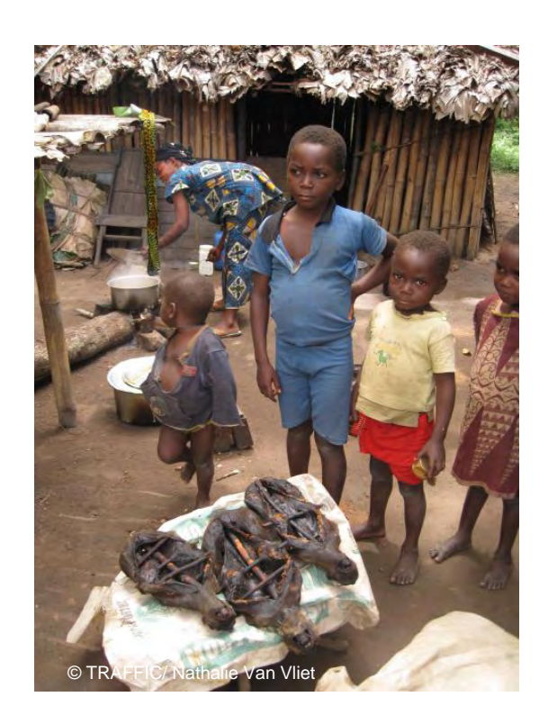
Photo 3: Kids selling smoked bushmeat along the road from Lubutu to Kisangani, DRC, May 2009

SYVBAC will also respond to various requests for inputs to the international fora and conventions such as inter alia Convention on Biological Diversity (CBD), Convention on International Trade in Endangered Species of Wild Fauna and Flora (CITES), Food and Agriculture Organization of the United Nations (FAO), World Health Organization (WHO), International Tropical Timber Organization (ITTO), regional bodies (e.g., COMIFAC) and the Congo Basin Forest Partnership (CBFP). In particular, at least two guiding governing frameworks, e.g. the CBD and its report of the Liaison Group on Bushmeat (2009), and the operational document relating to the Central African Forest Commission's (COMIFAC) Convergence Plan (2009) stand as examples of such demands from decision-makers.