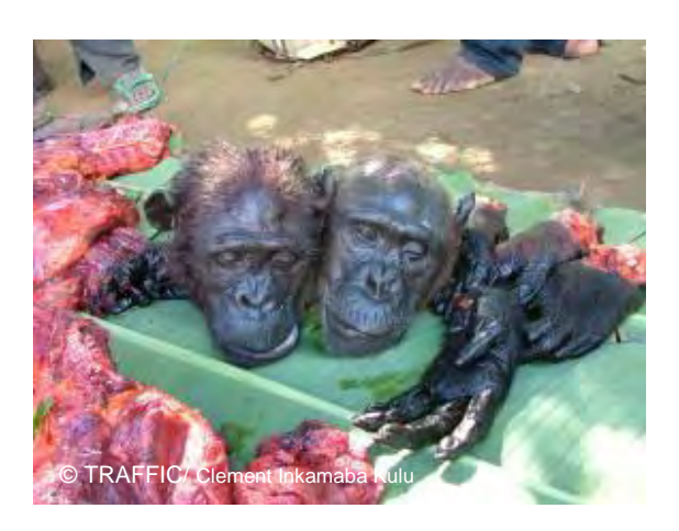
Photo 5: Primate meat on offer at Simombondo, at Gabon – Congo border