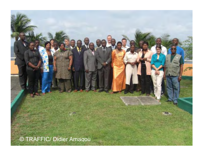
Photo 2: Participants at the workshop organized by TRAFFIC in Libreville, 8-10 June 2010

Stakeholders involved in the development of SYVBAC represent the working expertise from six central African countries in the region including representatives of the COMIFAC, Ministries of Forest and/or Wildlife Conservation (Cameroon, Central African Republic, Democratic Republic of Congo, Gabon, Republic of Congo), technical and scientific institutes (IRET, CIRAD, CIFOR, University of Reading), NGOs (FOREP, LAGA, RAPAC, TRAFFIC, WCS, WWF, ZSL and ZSSD/CRES), intergovernmental organizations (FAO, COMIFAC), development agencies (GTZ), representatives of the private forest sector (ALPICAM, PALLISCO, CIB, CBG, OLAM. SYLVAFRICA, TEREA, PAPPFG) and other specialists (FORAF, FSC, MIKE, BCTF).