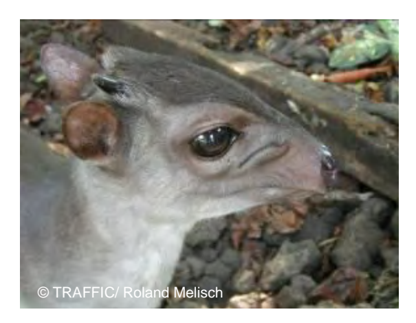
Photo 4: Blue Duiker Cephalophus monticola - species most commonly found in bushmeat trade

FAO: Food and Agriculture Organization of the United Nations