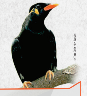
Common Hill Myna (Gracula religiosa)

This native species is protected in Singapore, making it illegal to catch them locally and sell them. Further, there is no way to ensure that the birds for sale were sourced legally (i.e. from other countries), so avoid buying.