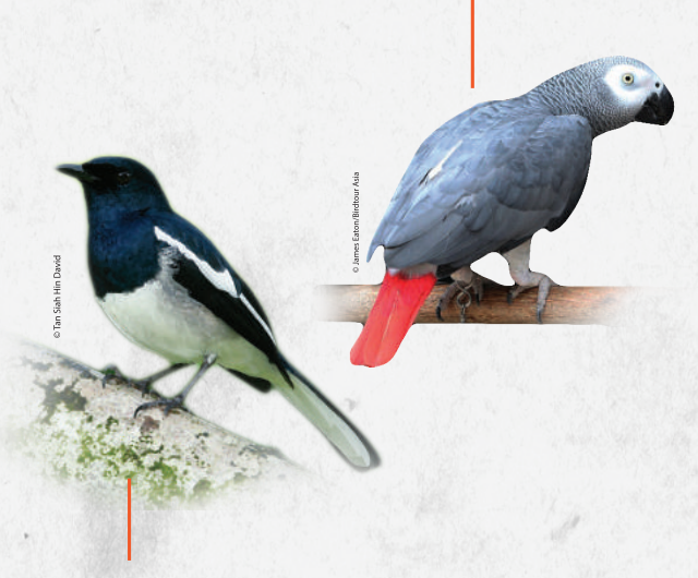
Oriental Magpie-robin (Copsychus saularis)

With no recent records of imports into Singapore, birds of this species for sale have not been imported legally; it is a species that has been recorded in seizures in other countries. You will require a licence for legal import of this species.