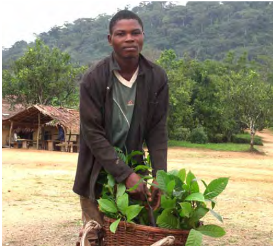
Young man heading to his new cocoa farm: an emerging income generating opportunity around Takamanda National Park

Wildlife trade interventions focusing on poverty alleviation and/or livelihood diversification need to be designed according to the nature and motivation for people's engagement in wildlife trade, and according to the particular species or product being targeted. At similar levels of profitability, hunting might still be preferred as it may offer a wider range of characteristics that make it attractive for forest dwellers (Brown, 2003). These include: 1. High returns to discontinuous labour inputs, with low risk and minimal capital outlay; 2. Excellent storage properties and a high value/weight ratio; it is easily transported and is thus an attractive commodity for producers in isolated areas who have few alternatives; 3. A commodity chain characterised by high social inclusivity, in both wealth and gender terms; 4. Labour inputs that are easily reconciled with the agricultural cycle, and with diversified income-earning strategies; 5. Unlike many high-value marketed commodities, usage can readily be switched between consumption and trade. This range of socio-economic characteristics should be considered when developing alternative sources of income. Furthermore, livelihood interventions targeted solely at subsistence activities, or on poorer households who harvest wild products primarily for their own consumption, seem likely to have little impact on the harvesting of wildlife for trade in order to generate cash income.