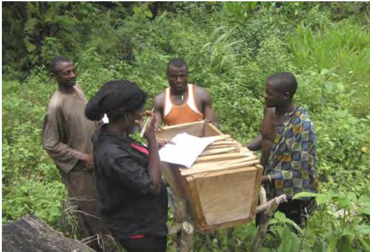
Hive construction during a training workshop in Lebialem, Cameroon