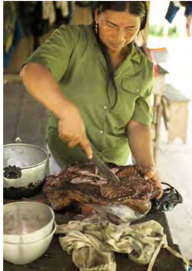
Huaorani women preparing bushmeat in Ecuador

The project also supports the Association of Huaorani Women of the Ecuadorian Amazon (AMWAE). AMWAE, has undertaken dialogues and ongoing community training on governance and land management, which are necessary groundwork to establish hunting rules, regulations, and ecosystem management. An agreement was also signed between AMWAE and Fundación Natura where communities agreed not to trade wildlife and not to hunt tapirs (even for subsistence purposes).