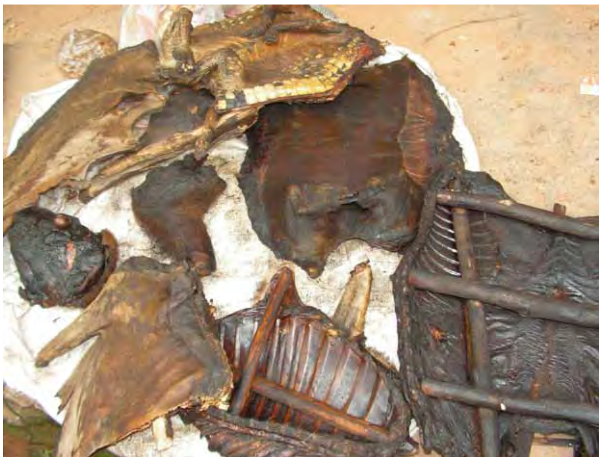
Smoked bushmeat sold in Mamfe, South West Cameroon

Hunting households are not the only beneficiaries of the bushmeat trade. Throughout tropical forest countries, bushmeat generates income for a variety of stakeholders including those who transport it at all points along different supply chains and those who trade it in roadside locations, in established markets, door to door, or in restaurants and shop halls. From first harvest to final sale, the trade in bushmeat for local, national or regional trade now forms an important part of the informal sector’s “hidden economy”. Access to markets is a key factor in realizing economic values of wild products, including bushmeat. If prices and profits are high enough, local traders will make use of any transport networks, over considerable distances to get perishable goods to market. As a result hunting and the bushmeat trade, although largely ignored in official trade and national statistics, play a crucial role in the economies of numerous countries, but being part of the hidden economy, are not tapped as a source of government revenues (Fargeot, 2009).