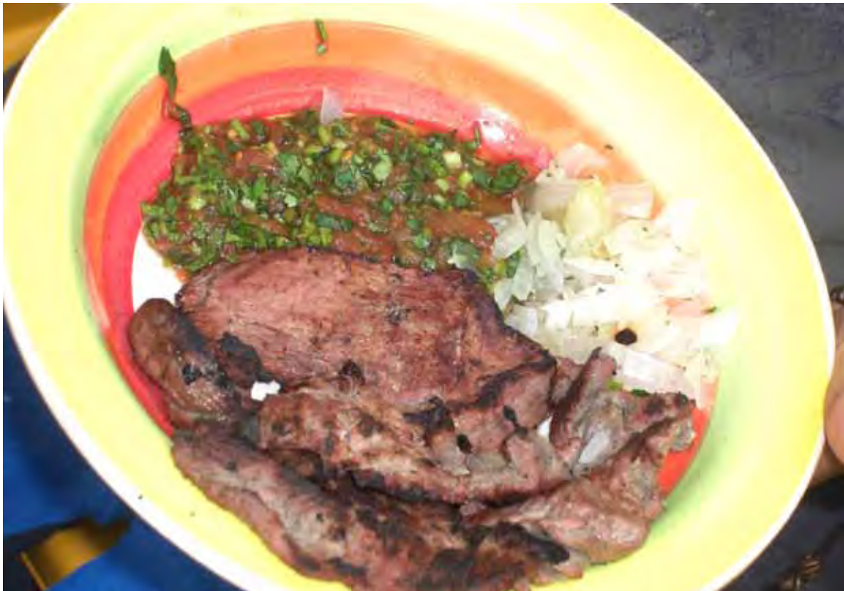
Meat of red brocket deer in a community neighbouring the Calakmul Reserve (Mexico)

The preference for bushmeat is also dictated by cultural reasons, particularly for indigenous peoples. Many cultures still employ traditional medicine that includes animal-derived remedies (Alves and Alves, 2011) and animals often fulfil both a nutritional and a medicinal role. Probably the most famous of these are the Chinese, who use animals for a variety of ailments. Many vertebrates, including tigers, bears, rhinos, turtles, snakes, tokay geckos, pangolins, monkeys and swiftlets are traded as raw materials of traditional Chinese medicine. Lesser known and studied, though just as varied and rich is Latin America's long tradition of animal-remedies for all kinds of ailments. In Africa, bushmeat consumption is also associated with tradition. In some rituals and ceremonies, such as men's circumcision ceremonies in Gabon or burials in South East Cameroon, large quantities of bushmeat must be served to the participants (Angoué et al. , 2000; van Vliet & Nasi, 2008). The traditional role of bushmeat has also been shown in Equatorial Guinea, where some species are considered to have magical or medicinal properties that increase their value (Kümpel, 2006).