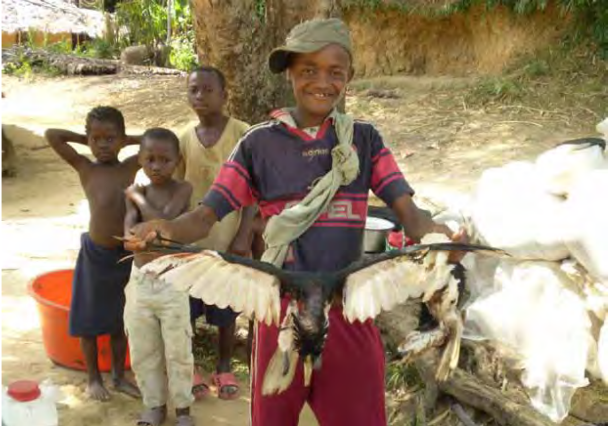
Young kid showing a hunted hornbill near Kisangani, DRC