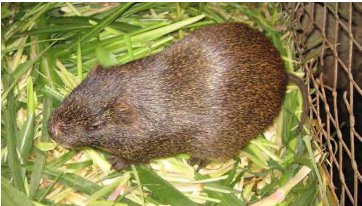
Grasscutter farm at the Faculty of Agronomy, University of Kisangani (Democratic Republic of Congo)