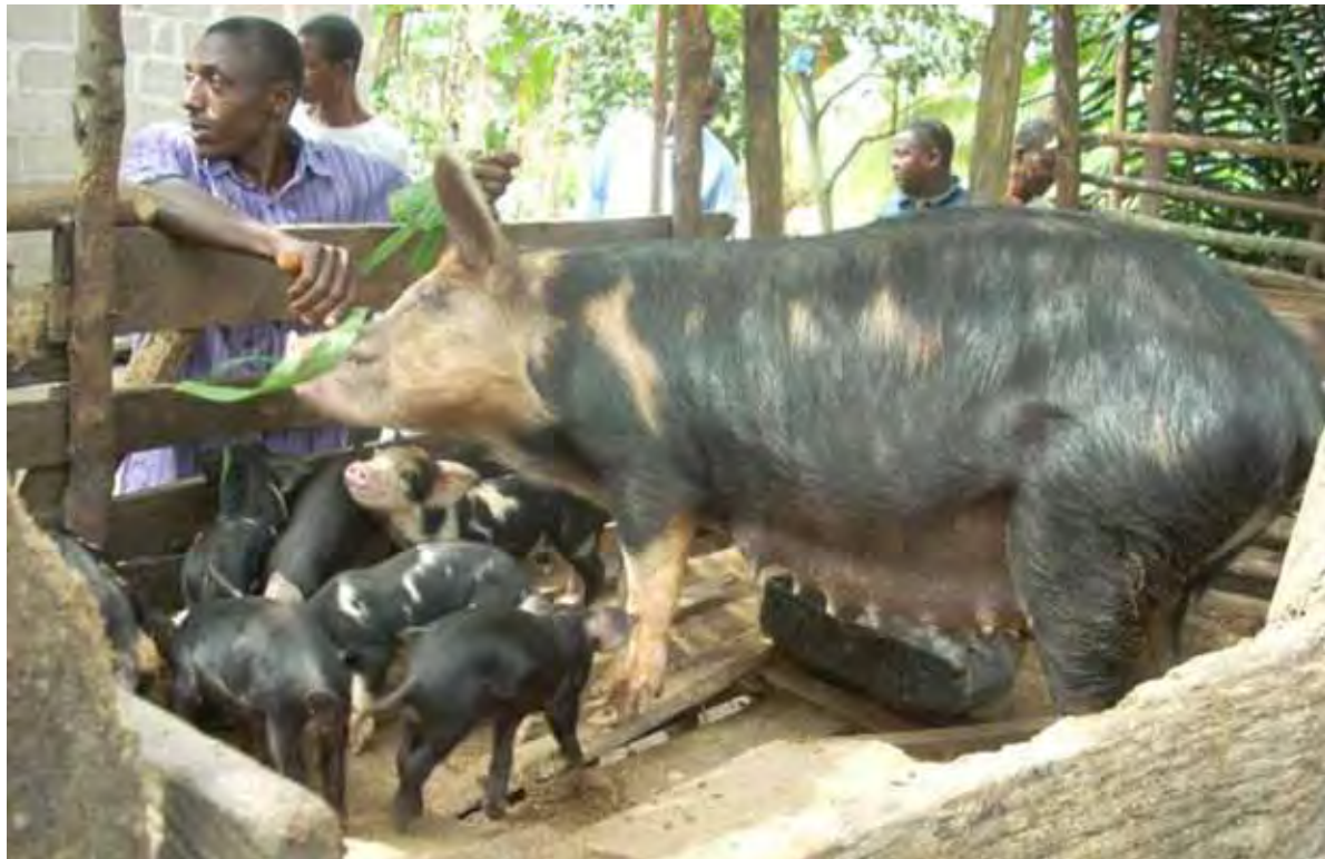
Pig farms developed by Community Action for Development in the Southern Bakundu Reserve area