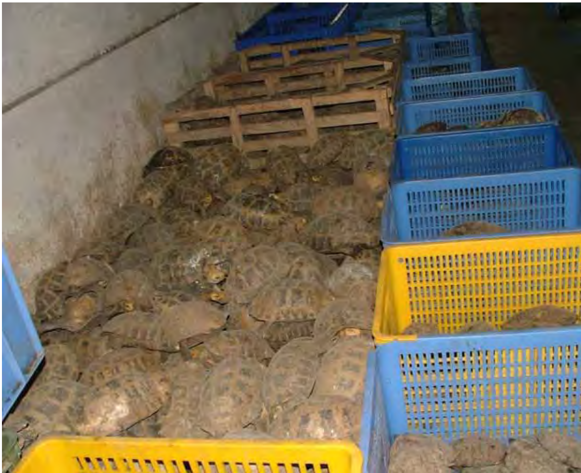
Tortoises sold in a Chinese market

Article 2 of the Convention on Biological Diversity defines sustainable use as: The use of components of biological diversity in a way and at a rate that does not lead to the long-term decline of biological diversity, thereby maintaining its potential to meet the needs and aspirations of present and future generations. In practical terms, a sustainable use is one which is perpetuated over the long term. Often local interest in the resource is an important factor in maintaining its quality. Obviously as one cannot sustainably use a resource that has vanished, the statement that sustainable use is a form of conservation has some merit. It should be clear that all uses, consumptive or non-consumptive, will impact ecosystems in some way. These impacts will translate into more or less dramatic effects on the local environment depending on what is harvested and how. Ultimately, for bushmeat use and alternatives to be sustainable, they must be so from social, ecological and economic viewpoints.