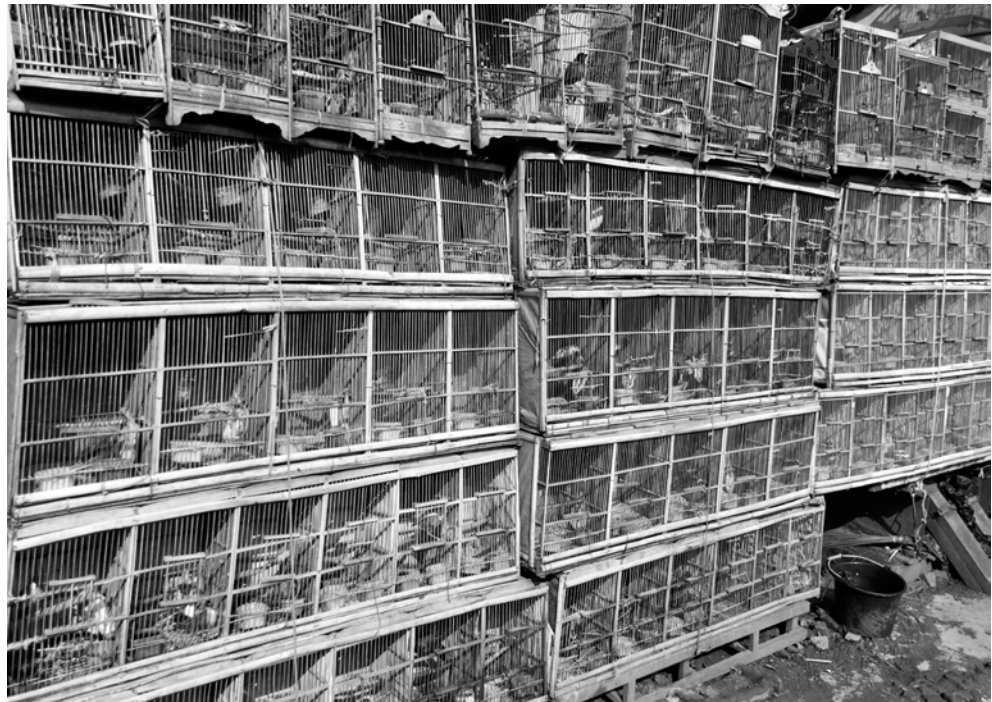
Rows of cages at Pramuka market.