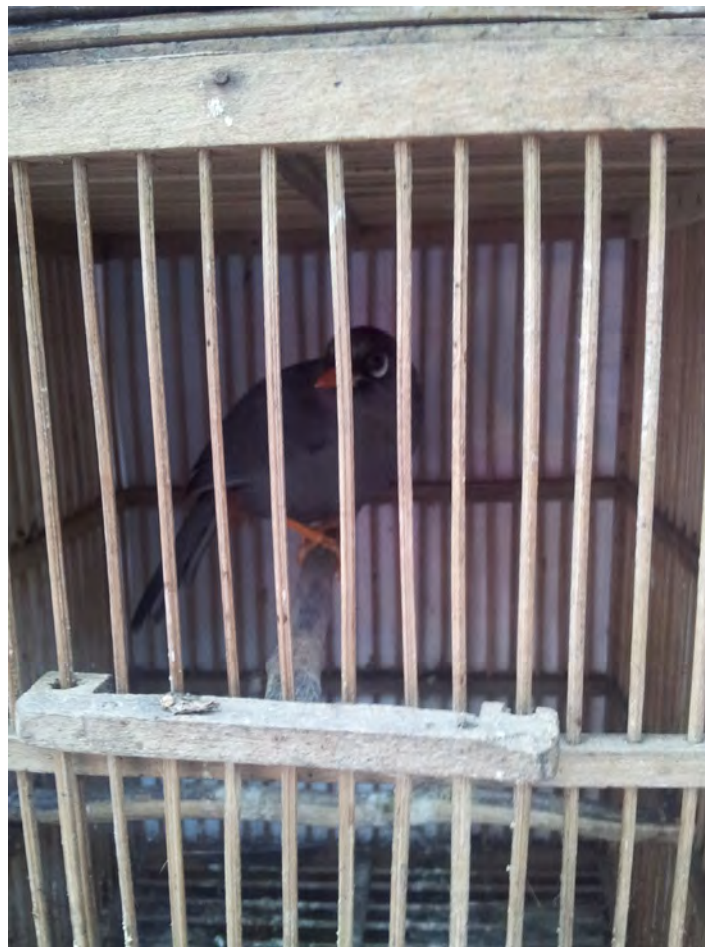
Chestnut-capped Laughingthrush for sale

In one instance at Pramuka market, the crown of a Yellow-vented Bulbul Pycnonotus goiavier was dyed orange and the bird offered as a Straw-headed Bulbul for USD172 – the average asking price for this species was USD547, the third-highest behind Scarlet Macaw and Bali Myna. This was the only example of a species being passed off as another. In Jatinegara, some Collared Scops Owl Otus lettia chicks and Scaly-breasted Munias were dyed bright colours, presumably to make them more attractive to buyers. Domestic chicken chicks, treeshrews Tupia spp. and Sugar Gliders Petaurus breviceps for sale at Jatinegara were also commonly bleached or dyed various colours.