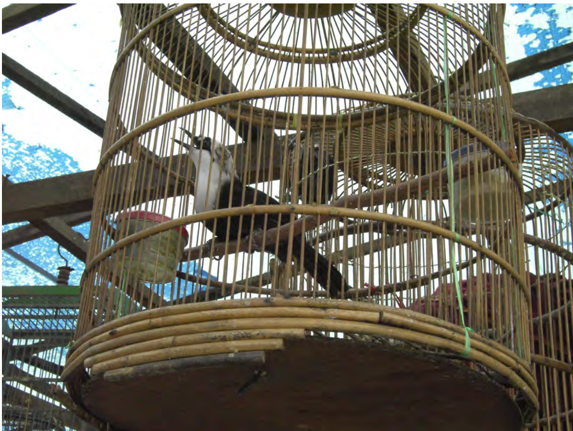
A Sumatran Laughingthrush, one of the species seen for sale in the markets

From these native Indonesian species, a total of 4096 birds of 57 species and subspecies were endemic to Greater Sundas, Lesser Sundas, Sulawesi and Maluku (Figure 1). A further 22 individuals of six species and subspecies recorded were endemic to the island of New Guinea (consisting of Papua New Guinea and Papua province of Indonesia).