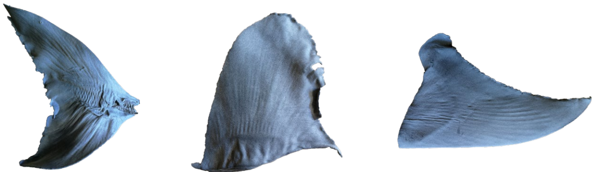
The replica shark fins after 3D printing using sintered nylon as the main material (Bowmouth Guitarfish caudal fin, Oceanic Whitetip dorsal fin, and Great Hammerhead pectoral fin)

to weight ratio, and the surface has a slightly rough sandpaper-like texture similar to real dried shark fins, which also allows for better adhesion of paint.