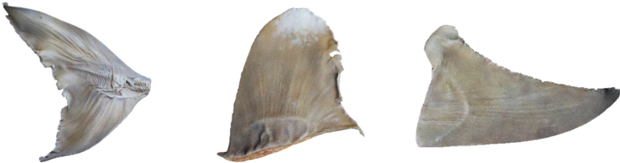
Replica shark fins after painting (Bowmouth Guitarfish caudal fin, Oceanic Whitetip dorsal fin, and Great Hammerhead pectoral fin)

Images of the sides and base of each fin and the painting process, including the airbrush colours and different paint brushes used for achieving the correct markings, can be downloaded here .