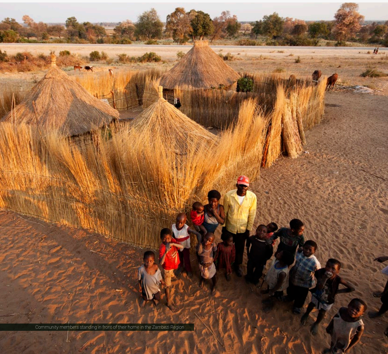
Community members standing in front of their home in the Zambezi Region

In conclusion, conducting offender surveys provides insight into the criminal, geographic, demographic, motivational and behavioural components of wildlife crime. Without much needed behaviour change interventions and alternative sustainable livelihood options in the manners described above, wildlife crime will continue in and around protected areas. This report provides a firm foundation for initiatives to address these recommendations.