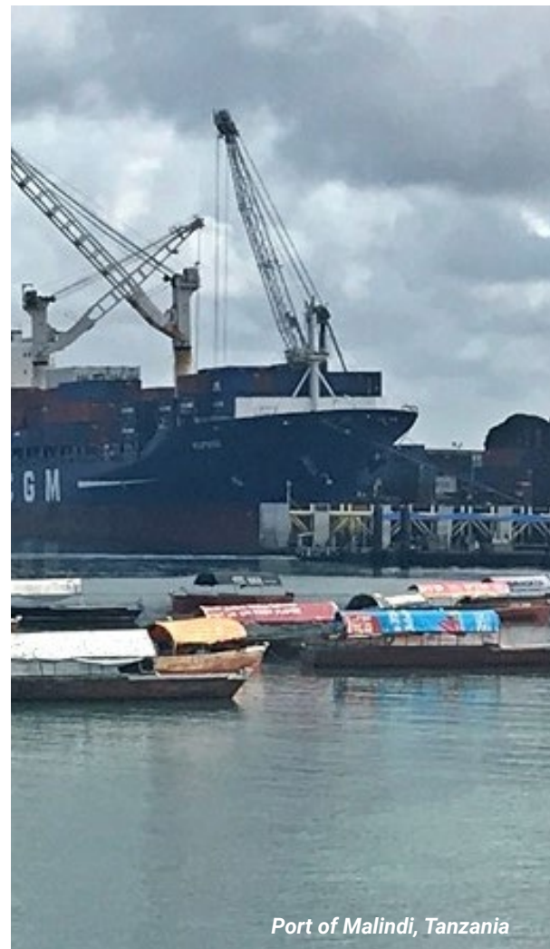
Port of Malindi, Tanzania

In 2014, Tanzania established a National Elephant Action Plan, a National Ivory Action Plan (NIAP) and a national strategy to combat the illegal wildlife trade (World Bank, 2019b). Under the NIAP process, Tanzania has significantly improved legislation and law enforcement performance, resulting in more arrests, prosecutions and higher penalties to address ivory trafficking (CITES, 2018).