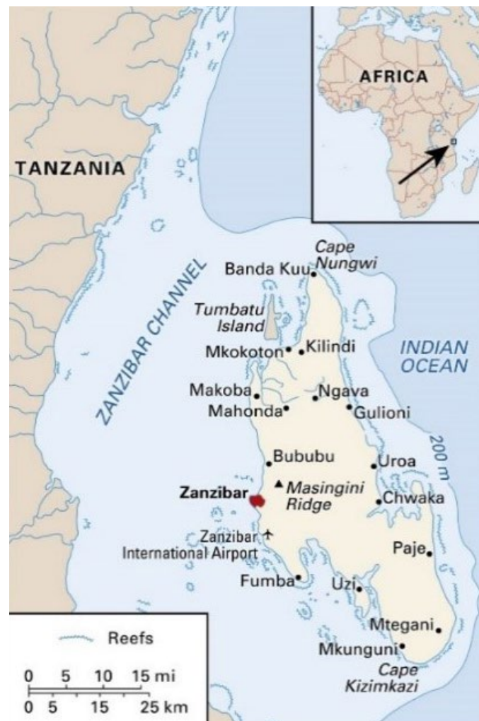
Figure 2: Map of Unguja island

The Port of Zanzibar has two berths (next to each other), one for cargo and the other for ferries and passengers’ boats (Anon, 2019e). It is the main entry point handling international trade for the islands of Zanzibar and about 95% of imports and exports pass through this port (Anon, 2019k). In 2016 the Port of Zanzibar handled 75,000 TEU transited the port and activity since has increased which has led to congestion and storage space issues (Anon, 2019e). Currently the port accommodates one large container ship vessel and six feeder vessels from smaller shipping lines per week (Anon, 2019l). To address this, Zanzibar is planning to build a new multipurpose port at Maruhubi area, approximately 2 km north of the current port with the Chinese company, China Harbour Engineering Company (Anon, 2019m).