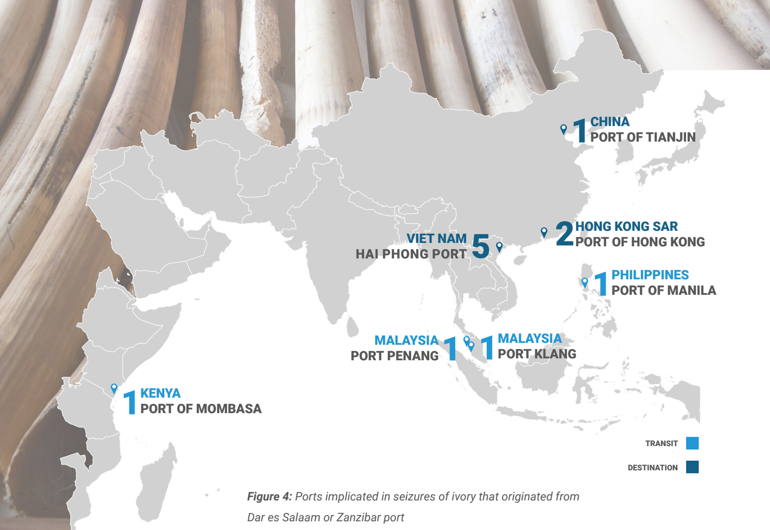
Figure 4: Ports implicated in seizures of ivory that originated from Dar es Salaam or Zanzibar port